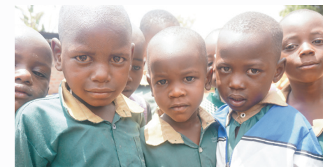
The benefits of receiving a regular meal have been stark, with higher grades being achieved by the students, year after year.

this can lead to my good future" explained one of the students at Canrom Primary School.