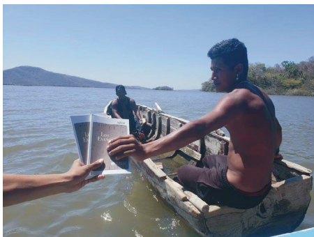
The Red Letter Gospels have been shared with people around the world in native languages suitable for each country.

Feed The Hungry's mission is to demonstrate and share Christ's Love for all people, particularly to those who are overlooked by the rest of the world. We do that by feeding children, young people and those who are particularly vulnerable, but also by sharing the Gospel of Jesus Christ.