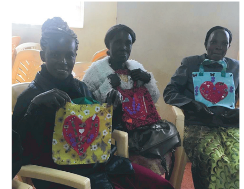
Attendees took part in a range of activities and reflections

After the conference, God continued to work. In the Kibera slum, the team visited the home of an elderly lady whose 9 month old grandson had been ill in hospital and was unable to eat. As the child was prayed for, he was instantly healed and ate bread and butter, drank Chai and began to clap and laugh!