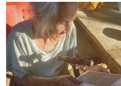
Additional copies of the Gospel have been made available to the communities in which the feeding programmes take place.

"The local Pastors have been so grateful. Some of them travel really far; sometimes 10, 15, 20 hours to get training with us in how to effectively use the Bible materials we supply. They come with such a hunger and desire to learn, because the children in their communities have never had any sort of physical resource in the hand to be able to learn and receive from."