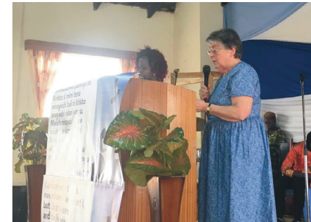
The Team shared teaching from the Bible and their testimonies.