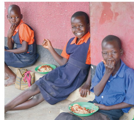
South Sudanese Refugee young people receive a regular meal provided by Feed The Hungry through their school.

In 2014, the first year of the Full life program ran 5 refugee students achieved a Division 1 result. This was proven to be no accident when another five achieved it in 2015. In 2016, this sky-rocketed to 15 students achieving a Division 1 result, and no single student who sat the exam failing. In 2017, an amazing 27 refugee students achieved a Division 1 result – which means the top 1% of the country!