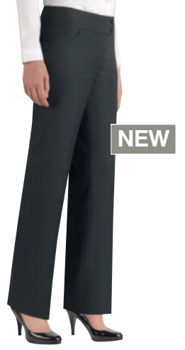
Camden Trouser pg 11 Front Fastening, Slim Leg, Curved comfort style pockets, Key loop, 2 feature hip pockets, Low waist with deep waistband, Feature Lining. Machine Washable Available in sizes 6 to 24 Also available in sizes 11 & 13