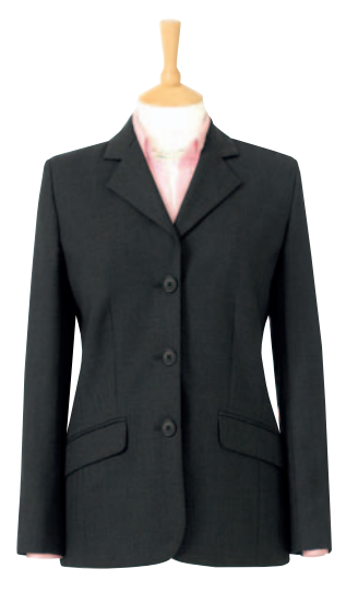
Bankside Jacket pg 8/9 Single Breasted Jacket, 3 Button Fastening, Feature Lining. Machine Washable Available in sizes 6 to 24