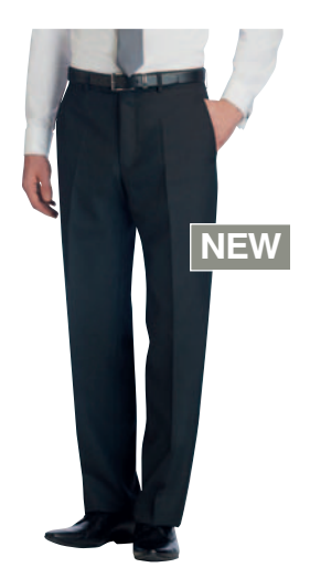
Stanford Trouser pg 6 Flat Front, French Bearer, Belt Loops, Hip pocket, 1/2 Lined to Knee. Machine Washable Available in sizes 28" to 50" in S, R, L and 37" leg length