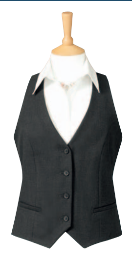
Adelphi Vest pg 11 4 Button Fastening, Fabric Back, Feature Lining. Machine Washable Available in sizes 6 to 24