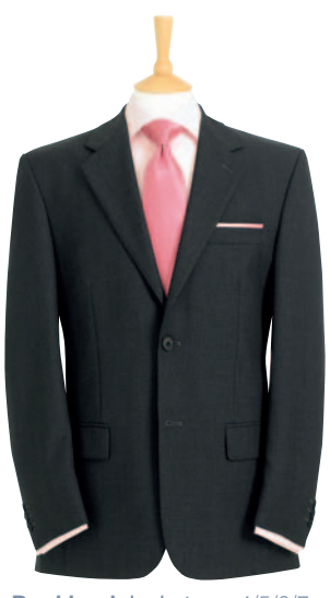
Dockland Jacket pg 4/5/6/7 Single Breasted Jacket, 2 Button Fastening, Side Vents, Feature Lining. Machine Washable Available in sizes 36" to 54"