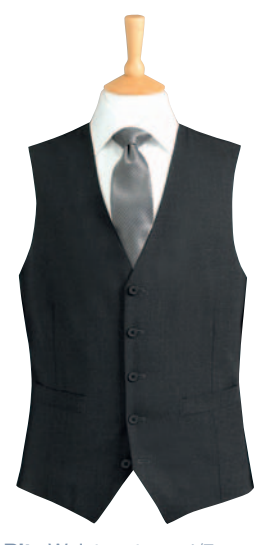
Ritz Waistcoat pg 4/7 5 Button Fastening, Fabric Back, Feature Lining. Machine Washable Available in sizes 36" to 50"