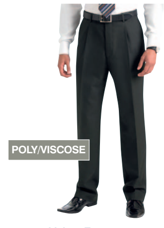
Lisbon Trouser pg 7 Men's Poly/Viscose Single Pleat, French Bearer, Hip Pocket. Machine Washable Available in sizes 30" to 50" in S, R, L and 37" leg length