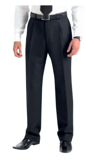
Principle Trouser pg 7 Single Pleat, French Bearer, Hip Pocket, 1/2 Lined to Knee. Machine Washable Available in sizes 28" to 50" in S, R, L and 37" leg length