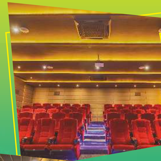
Amenities at a Glance