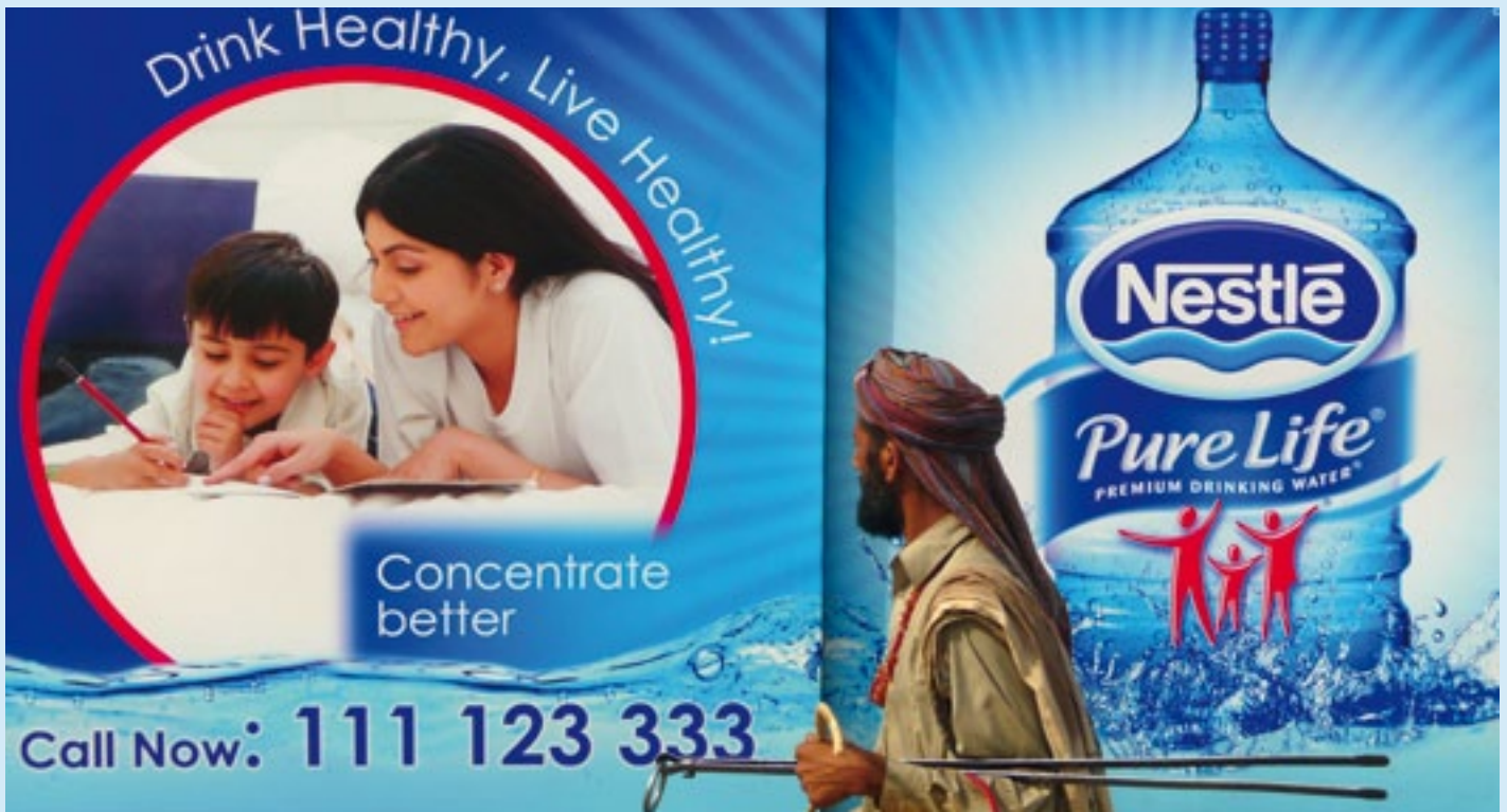
▲ Advertisement for Nestlé's Pure Life