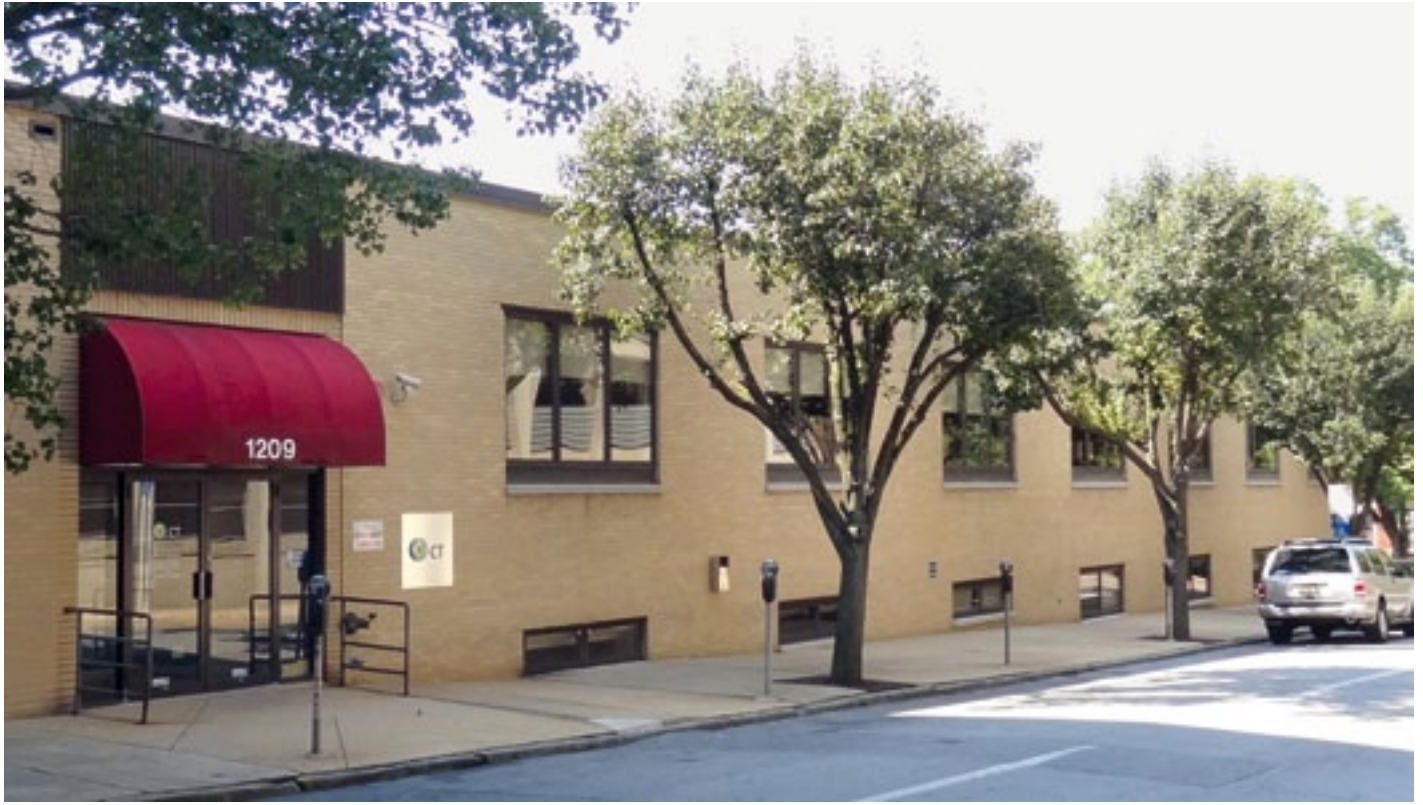
▲ CT Corporation office, 1209 North Orange Street, Wilmington, DE 19801-1120. It is home to over 6,500 corporations, and more than 200,000 businesses hold addresses at the location.

Vehicles (SPVs) are also popular. SPVs are temporary legal entities, limited companies, or limited partnerships. Companies can use SPVs to transfer debt. Banks often use them to turn loans into tradable financial products. For example, a bank that puts mortgage loans into an SPV legally separates itself from the loans. The bank further removes itself from the risk of those loans by selling them to investors as mortgage-backed securities (financial products based on the repayments of mortgage loans). Investor's difficulty in judging the value and risk attached to these products became one of the main impetuses of the financial crisis by distancing mortgage payers from investor attitudes towards their supposedly stable, AAA-rated financial products.