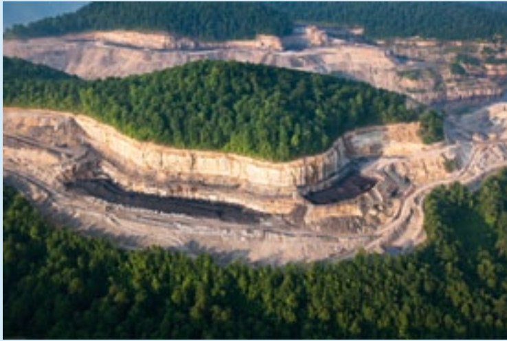
◀ Mountaintop removal in the Appalachian Mountains