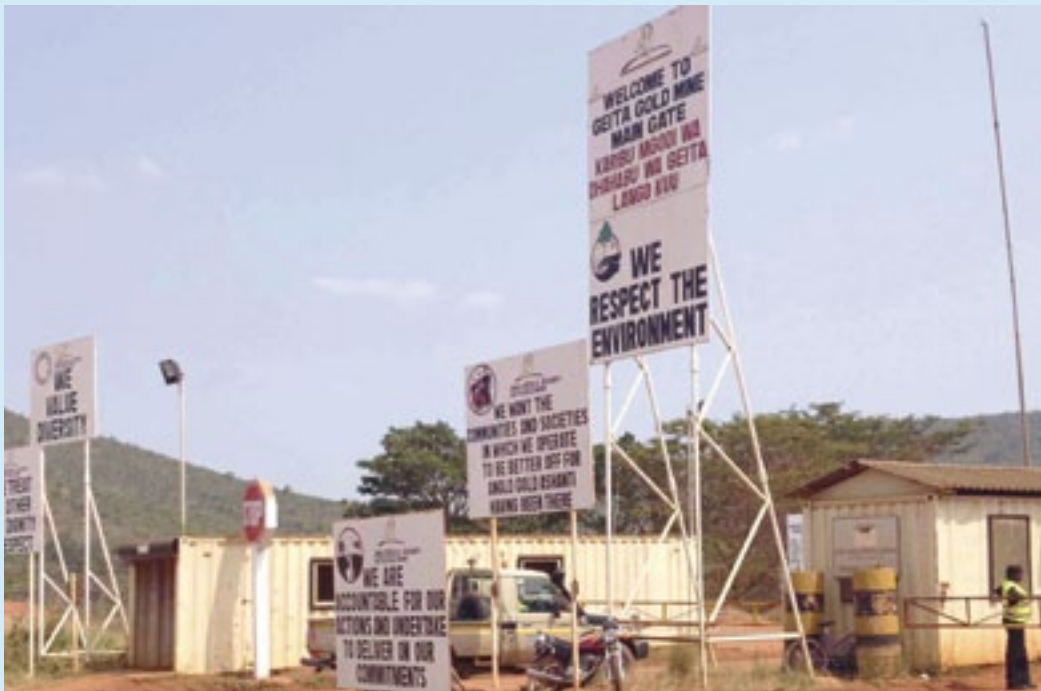
◀ AngloGold Ashanti, main entrance to the Geita Gold Mine.