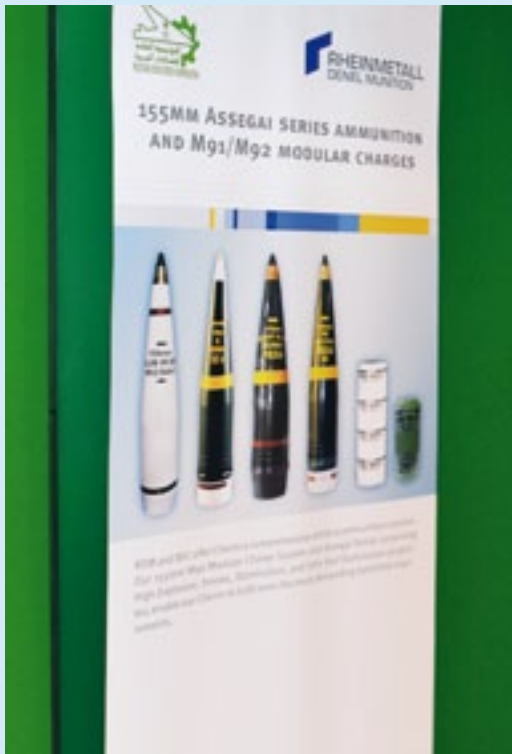
◀ Advertisement for the “Assegai Series” of artillery ammunition – a joint venture between Rheinmetall and the Saudi Arabian MIC (Military Industrial Cooperation) at the IDEX 2013 weapons exhibition in Abu Dhabi.