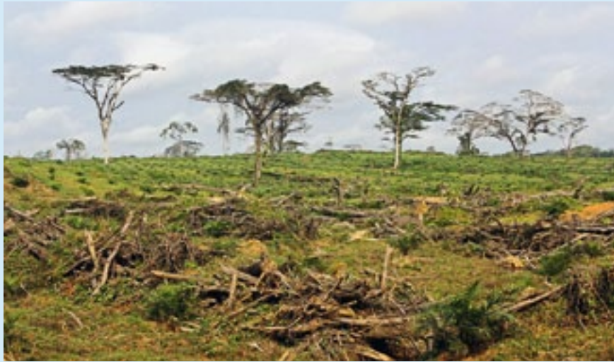
◀ New palm oil plantation at the Golden Veroleum concession in Sinoe County, Liberia