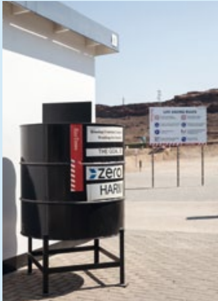
▶ Entrance of the Rössing Uranium Mine in Namibia.