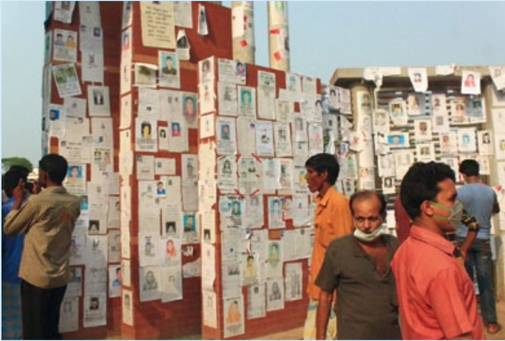
▲ Savar building collapse – missing board.

under deplorable conditions for the minimum wage, $38 a month. Safety issues pose a constant threat to Bangladeshi garment industry workers. Fires and machinery explosions claim scores of lives every year (e.g. the Tazreen garment factory fire in November 2012 killing 112 people). 9 In the last 11 years (excluding the Rana Plaza collapse), poor safety standards accounted for 730 deaths. 10