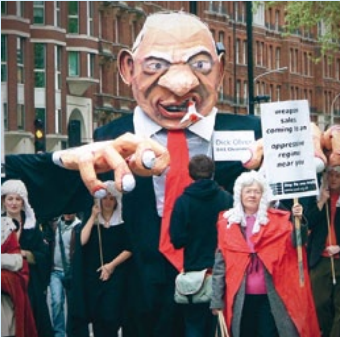
◀ Civil society protest against BAE Systems.

quently fined BAE $79 million in May 2011 for violations of the Arms Export Control Act. BAE only narrowly escaped debarment from U.S. government contracts. 12