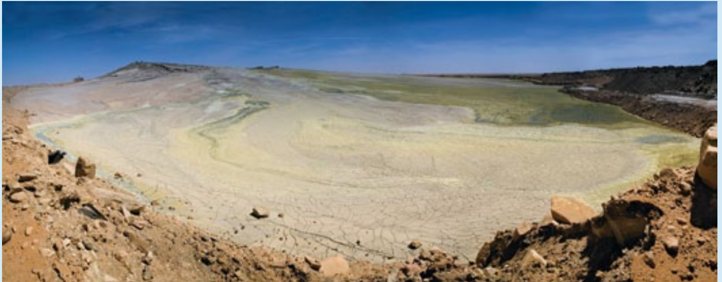
▲ Mountain of uranium tailings in Niger

over 40 years. 8 AREVA plans to open a third uranium mine – Africa’s largest – in Niger in 2015. 9