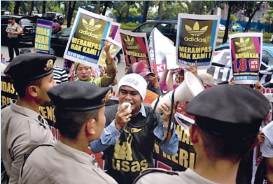
▲ PT Kizone Workers Action in Jakarta, 1. April 2013