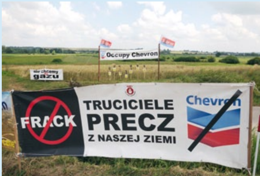
Protest against fracking.