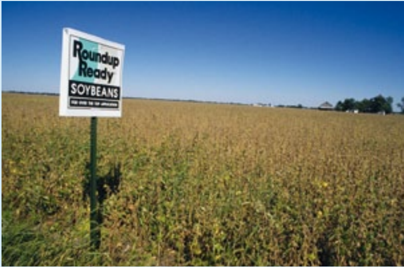
▲ Sign 'Round up ready soya beans' in field of genetically engineered soybeans.

contaminating a community for violating regulations that banned spraying pesticides near residential areas. 8