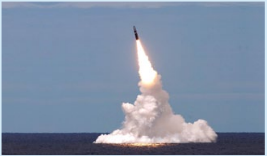
▲ Trident II D5 nuclear missile