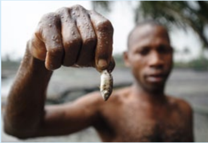
◀ Fisherman showing effect of oil pollution in local creek.