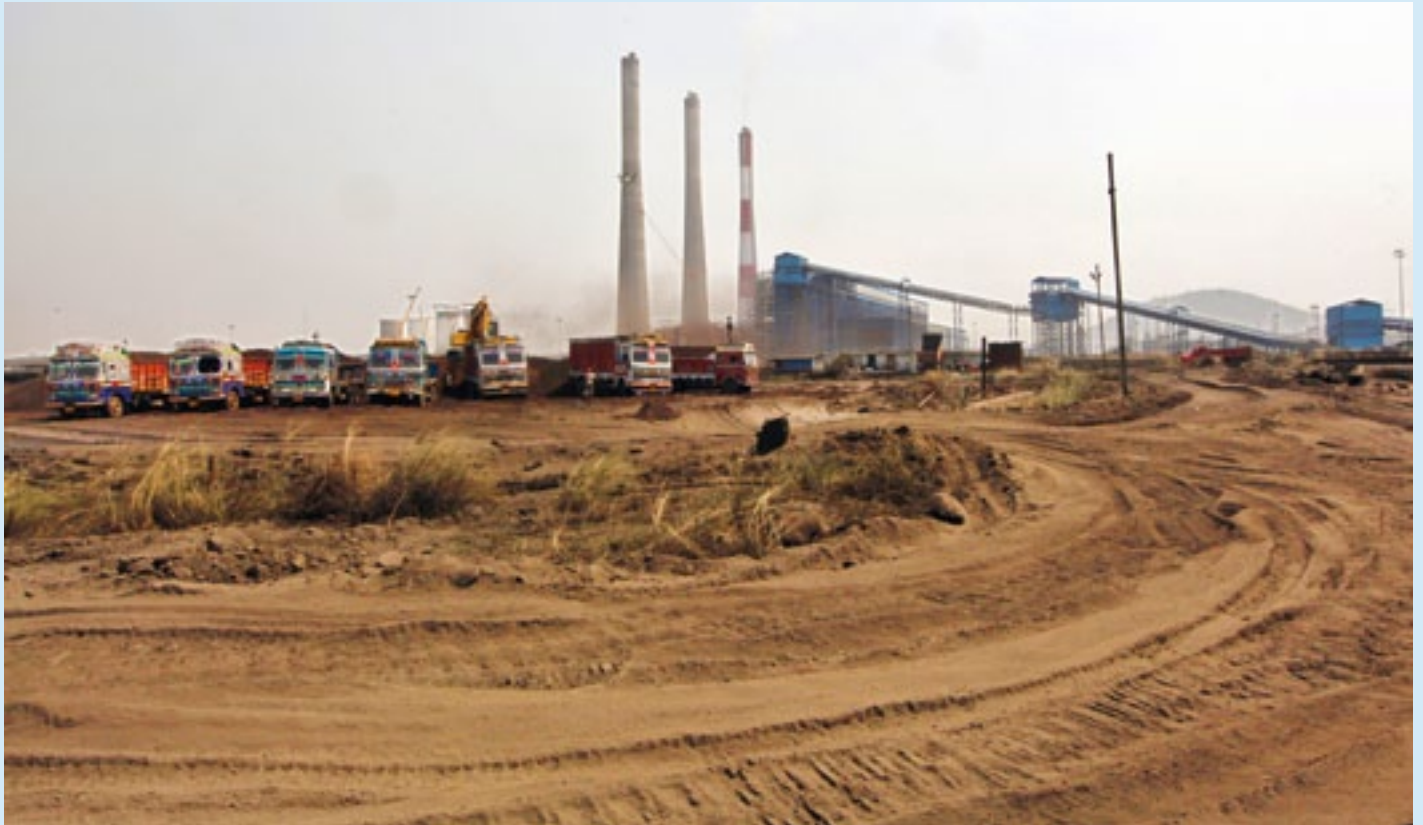
▲ A general view of the Jindal Power and Steel Ltd. complex is pictured at Nisha village in the eastern Indian state of Orissa March 27, 2012. Ten years after announcing the project, Jindal Power and Steel is still waiting to start digging for coal to fuel its $3.1 billion steel and power complex in Orissa. Picture taken March 27, 2012.

members from coming within the mine’s vicinity. There are several reports of security guards violently assaulting community members that pass through the gates on their way to their houses. 8