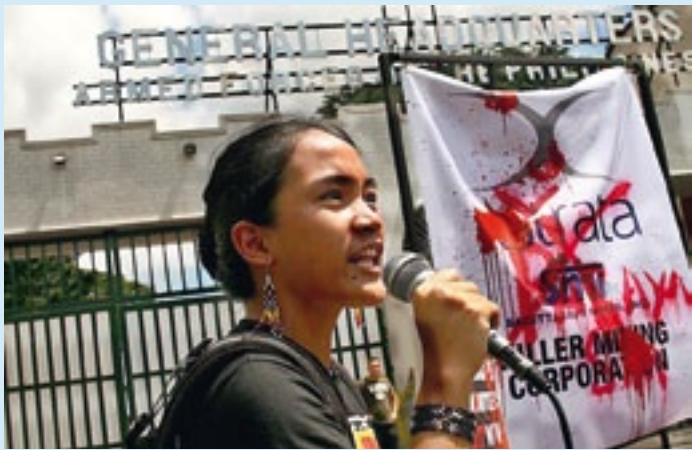
▲ Protest against the Capion massacre.