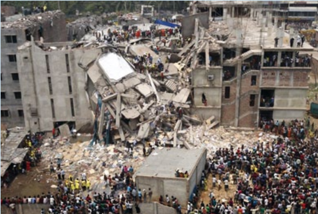
▲ Dhaka Savar Building Collapse.