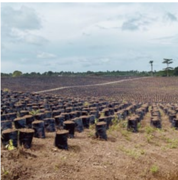
◀ Socfin oil palm nursery near Sahn Malen, Sierra Leone