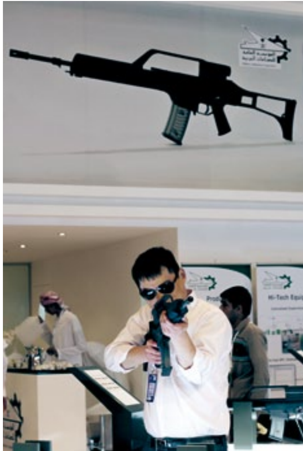
▲ German weapons to the front: IDEX 2013 booth of the Saudi Arabian company MIC which produces and sells German G 36 rifles under license from Heckler&Koch. German exports of small arms have more than doubled compared to the year 2011, in which 55% of the small arms export licenses were issued to non-NATO countries.