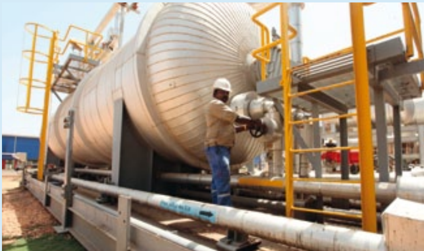
◀ An oil worker turns a spigot at an oil processing facility in Palouge oil field in Upper Nile state February 21, 2012, following a dispute with Sudan over transit fees. South Sudan will refuse to do any business in the future with oil trader Trafigura if it is proven that the firm bought oil from neighbouring Sudan in the knowledge that the cargo was seized southern crude, its oil minister told Reuters.