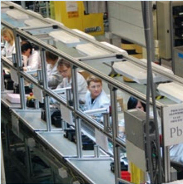
◀ Production line at Jabil Circuit Poland Sp. z o.o. in Kwidzyn