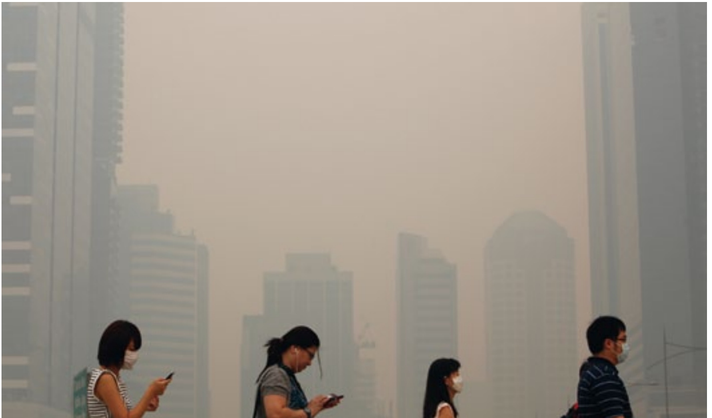
▲ In June 2013 haze from fires in Indonesia were blanketing Singapore. Many of over 800 fires burning appeared to be the concession areas of some of the world's largest palm oil and pulp and paper companies. Although it is illegal for companies in Indonesia to start forest or land fires, several companies have used fires for land clearing in the past. Office workers wearing masks make their way to work in Singapore's central business district. The smoke drove air quality to "hazardous" levels and disrupted business and travel in the region. © REUTERS/Edgar Su, June 21, 2013.