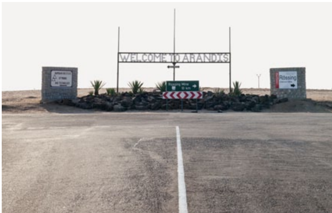
◀ Entrance to the Namibian community of Arandis, established for Rössing employees.

T his report exposes the financial ties between 19 European financial institutions (FIs) and 26 multinational companies, spanning multiple sectors, notorious for their poor environmental and human rights records. The purpose of this report is to raise awareness and to call on FIs to establish and/or improve policies governing financial services that are linked to violations of internationally accepted norms and standards.