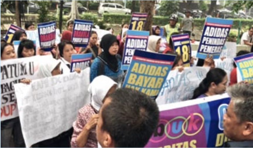
PT Kizone Workers Action in Jakarta, 1. April 2013

the dispute in April 2013 when they announced that they would pay severance to 2,700 Indonesian workers. 8