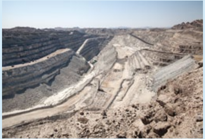
▲ Rössing Uranium Mine pit in Namibia

Dutch Shell case, which limited the reach of U.S. law in overseas human rights cases. 12