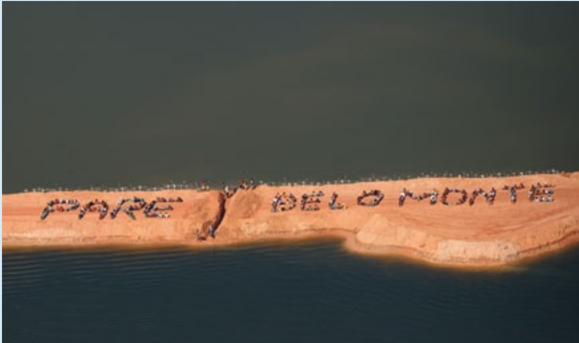
◀ Protest against Belo Monte Dam in Brazil

smoke that endangers worker and public health in the region. The company has refused to acknowledge any responsibility for health problems linked to their operation. 12