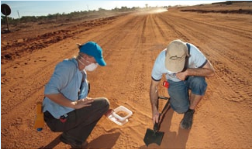
▲ ▶ Radiation measurements in Akokan, Niger