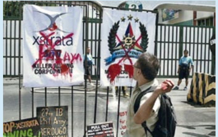
► Protest against the Capion massacre.

metals. 12 People believe that this contamination is linked to a recent increase in farm animal deformities. 13 Multiple studies by private and state entities found elevated levels of contaminants including aluminum, arsenic, copper, iron, lithium, and manganese in water and soil samples. 14 A study conducted by Peruvian state authorities that included 12,500 samples concluded that 2.2% of the samples were severely contaminated and 52.71% contained at least one parameter that exceeded official thresholds. In response to these findings, Xstrata cited the “natural background mineralization present in the region.” 15 Espinar’s mayor, Oscar Mollohuanca believes that the Tintaya mine is responsible for this contamination. 16 Anti-mine protests in May/June 2012 resulted in two deaths and multiple injuries. Mayor Mollohuanca was