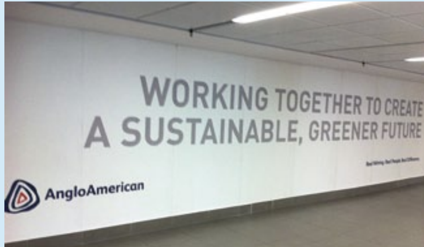
◀ Anglo American advertisement welcoming the 2011 UN Climate Change Conference attendees to South Africa.