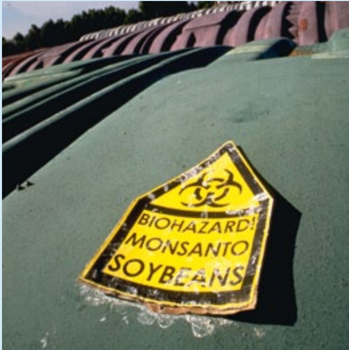
Greenpeace Action against GE soya beans from Monsanto in Louisiana.