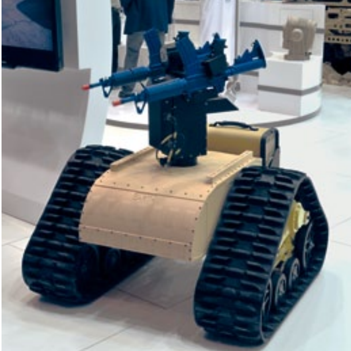
◀ Unmanned ground vehicle (UGV) manufactured by Emirates Advanced Research and Technology Holding (EARTH).