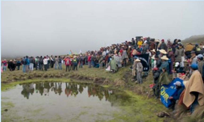
◀ Mass protest in Cajamarca, rally at mountain lake, May 31, 2012.