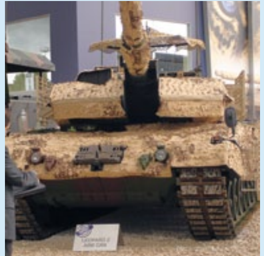
▶ Leopard 2 tank.

Ammunition” series, which includes insensitive munition (IM), high explosive (HE), conventional HE, screening smoke, illumination, infrared illumination, and many other projectiles. 7 Sources like the Jane’s Ammunition Handbook indicate that the 155mm Assegai family includes cluster munitions that have been banned by the Convention on Cluster Munitions. 8 Amnesty International claims that Saudi Arabian security forces commit frequent human rights violations, which include the use of excessive force against protesters, and the ill-treatment and torture of prisoners and detainees. 9