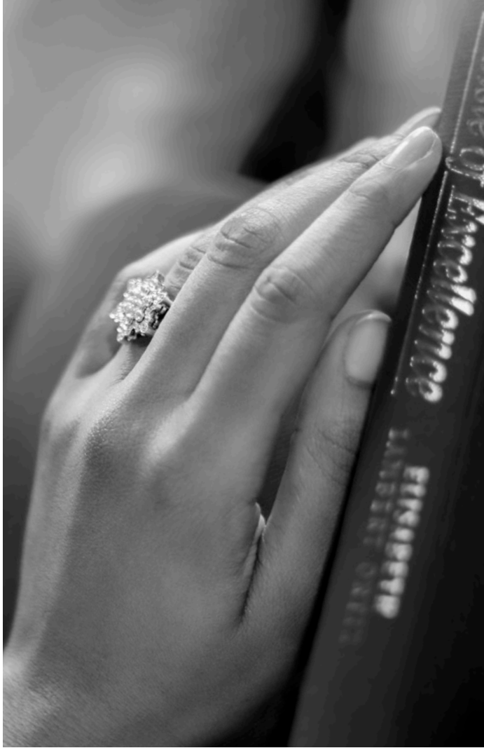
Collection L'Etoile strikes a balance between refined femininity and industrial modernity.