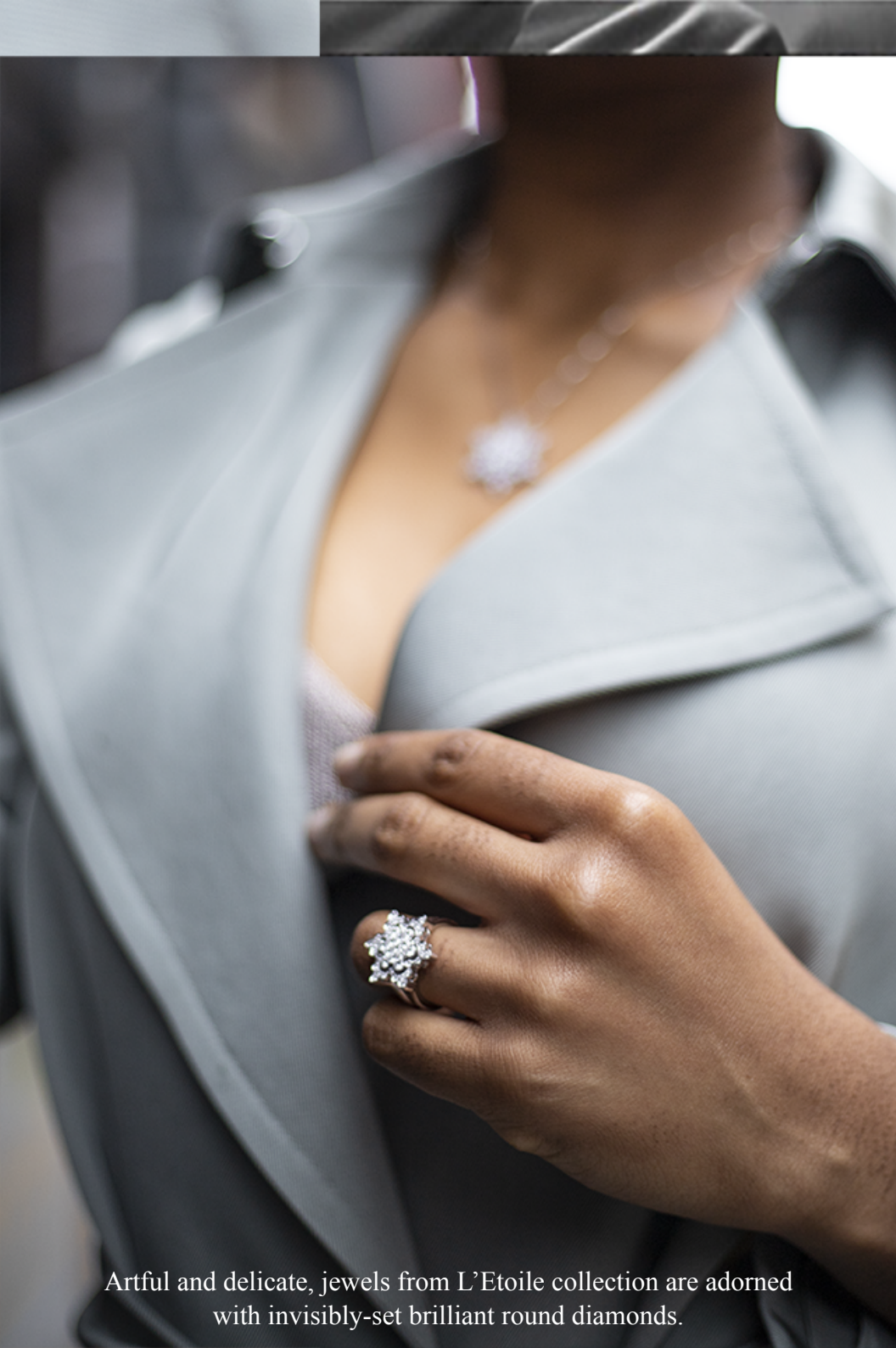
Artful and delicate, jewels from L'Etoile collection are adorned with invisibly-set brilliant round diamonds.