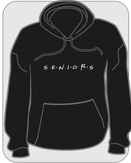
Black Hooded Sweatshirt 8oz. 50/50 fleece