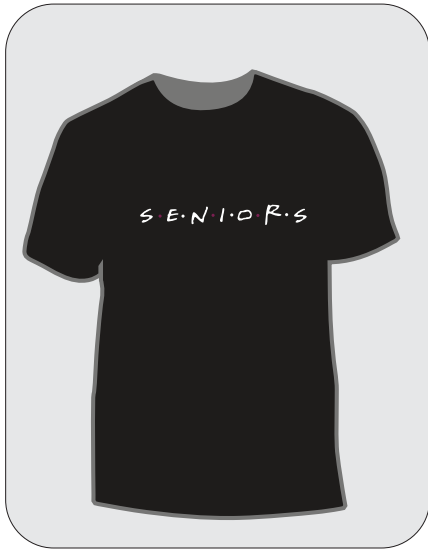
Black Heavyweight Tee 100% cotton pre-shrunk