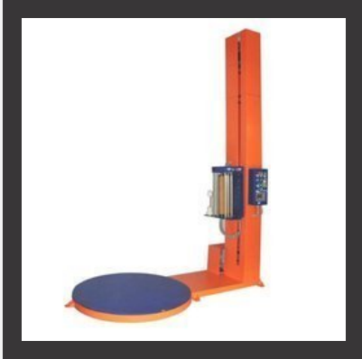
Industrial Stretch Wrapping Machine