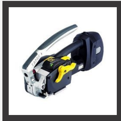
Portable Battery Auto Combination Tool