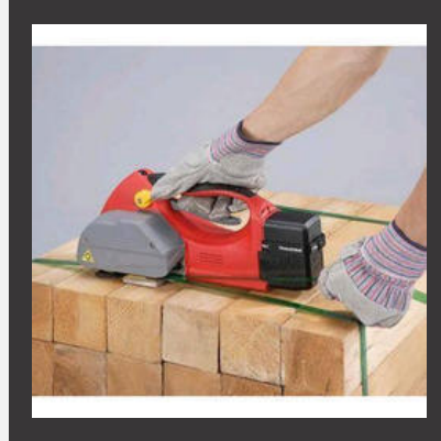
Plastic Strapping Machine