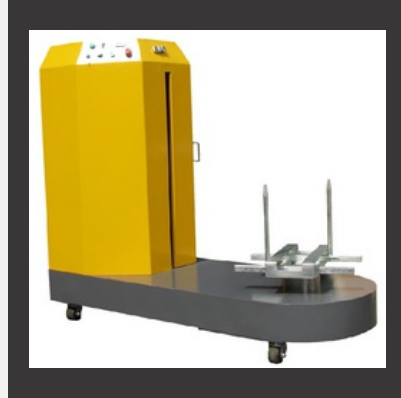
Stretch Wrapper Series