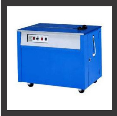
Semi Automatic Heavy Duty Strapping Machines