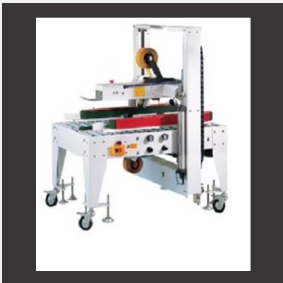
Random Size Carton Sealer