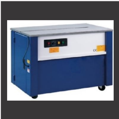
Semi Automatic Strapping Machine