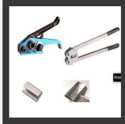
Manual Packaging Tools