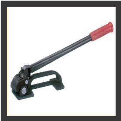
Steel Strapping Tensioner