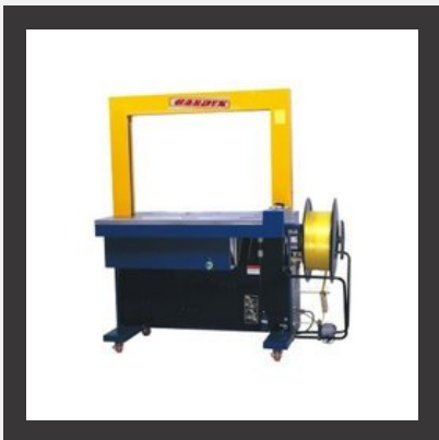
Stand Alone Strapping Machine