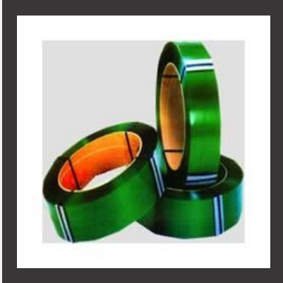
HDP Polyester PET Strappings