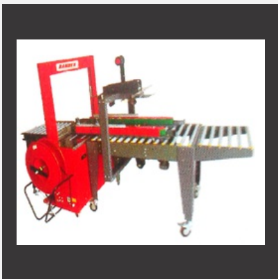
Strapping Cum Carton Taping Machine