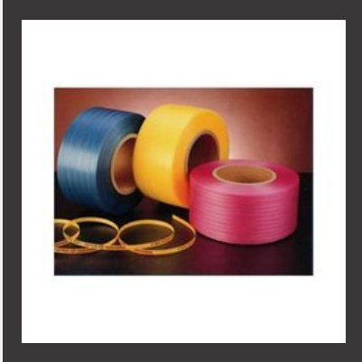
Heat Sealing Polypropylene Box Strappings