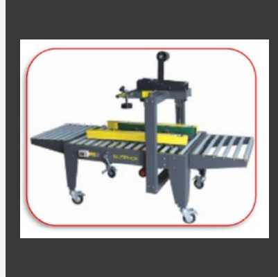
Carton Taping Machine