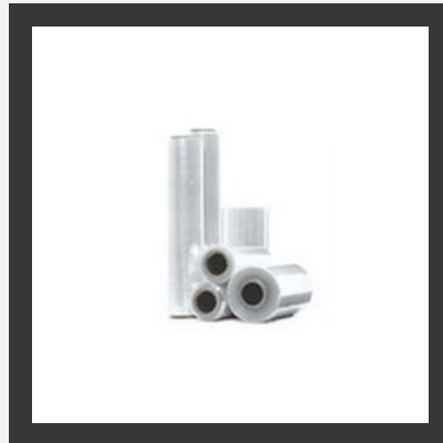
Polyolefin Shrink Film