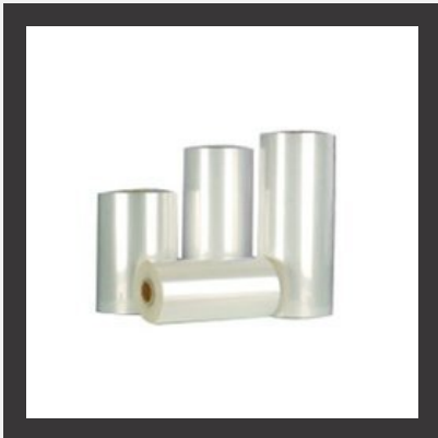
Stretch Wrap Film