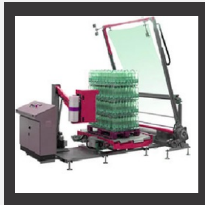
Fully Automatic Stretch Wrapper