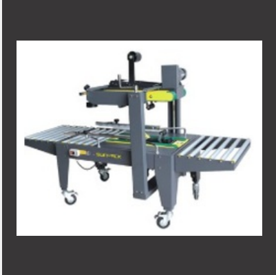
Semi Auto Carton Taping Machine