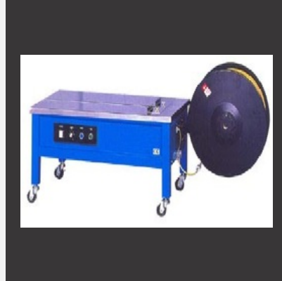
Semi Automatic Low Floor Machine Model