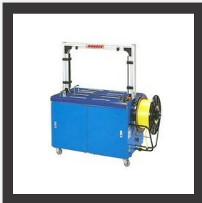
Fully Auto Strapping Machines