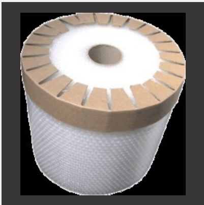
Paper Edge Protector