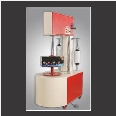
Carton Stretch Wrapper