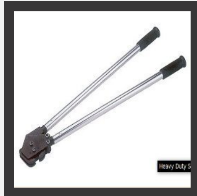
Heavy Duty Steel Strapping Tools