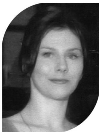
By Sophie Alexander View author biography

Northern Light has been providing strategic research portals, business research content, and search technology to global enterprises since 1996. Their SinglePoint strategic research portal provides a single point of access for all of a client's internal and external research and is fully customisable. It integrates a company's internal market research with licensed secondary research via a single, securely hosted solution. Northern Light handles all aspects of configuration, deployment, content aggregation, indexing and search, text analytics, collaboration, user management, document security and reporting.