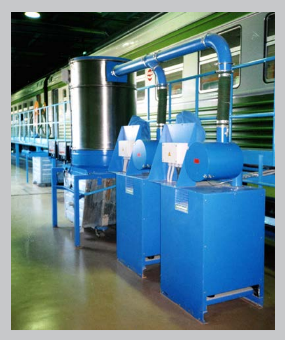
Two parallel vacuum units and a filter hopper. Suction line 200 m in both directions.