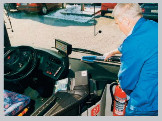
Industrial suction power in a bus cockpit.