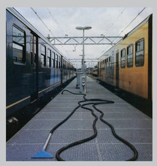
Wet cleaning of railway wagons. The pipework system is mounted under the platform. The suction inlet valves for flexible hoses are positioned under the grate.