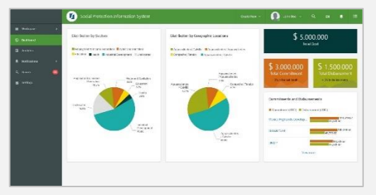
Results-based M&E of Social Assistance