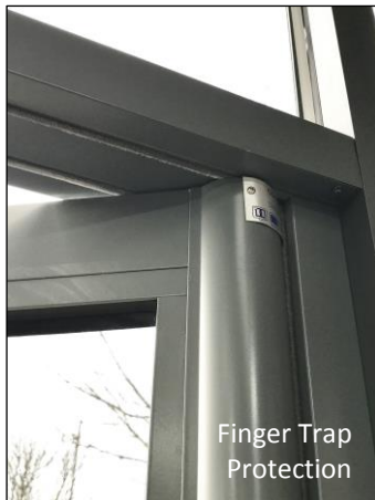
Finger Trap Protection