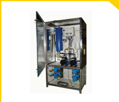
60 LIT/MIN ENCLOSED 4 TANK SYSTEM