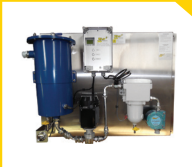
26 LIT/MIN WALL MOUNTED