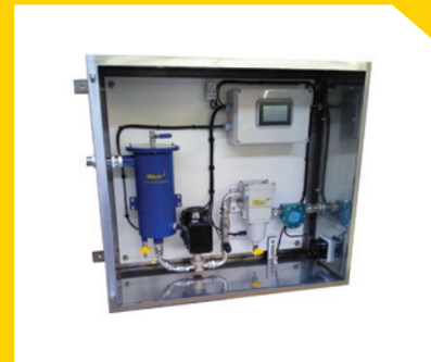
10 LIT/MIN ENCLOSED SYSTEM