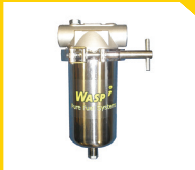
SUB MICRON BACTERIAL FILTER