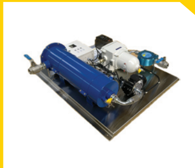
60 LIT/MIN WALL MOUNTED