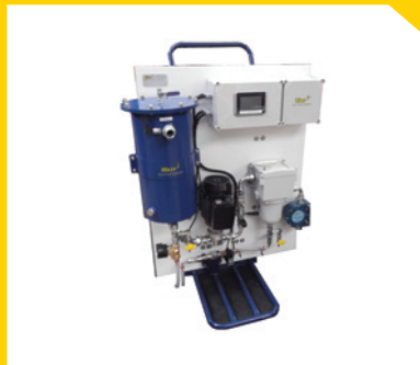
26 LIT/MIN PORTABLE