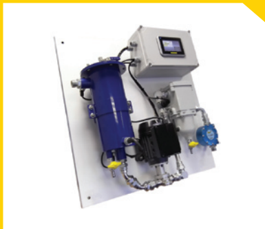
10 LIT/MIN WALL MOUNTED