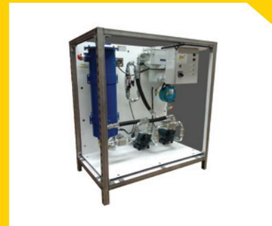
40 LIT/MIN FRAME MOUNTED