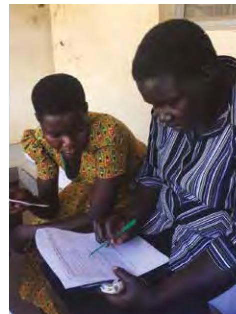
Training teachers on more inclusive teaching methods is a vital part of our approach. Here two trained mentor teachers discuss the individualised learning plan tool, which will help them to track the progress of children with disabilities in their class and better support their learning.

• A new tool addressing the challenges of monitoring learning outcomes of children with disabilities in school has been piloted with funding from the Marr Munning Trust. Lessons learned will be applied to our continued work in Rwanda but also in other East African countries where we are active.