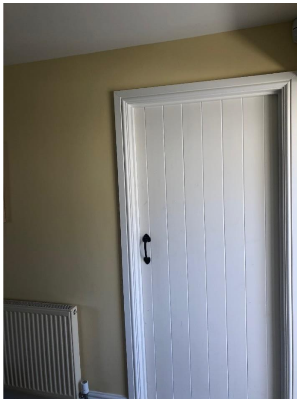
Colour Contrasting Walls and Doors