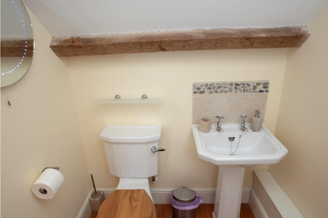
Double Bedroom Ensuite