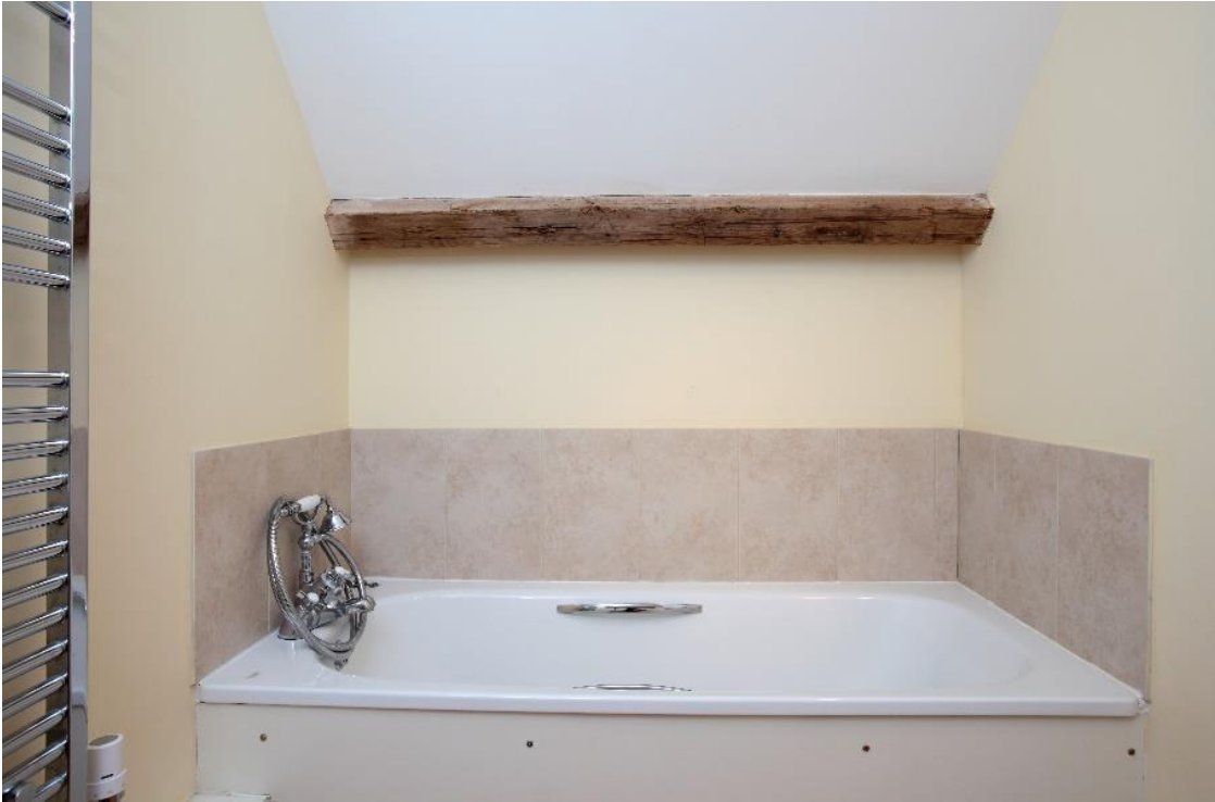
Double Bedroom Ensuite