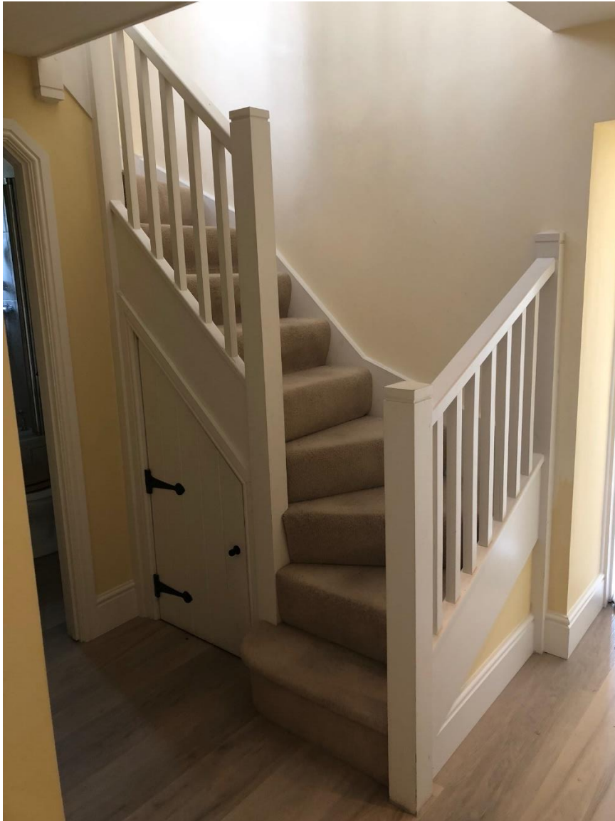
Stairs to First Floor