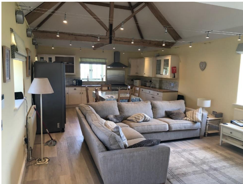
Kitchen and Living Area