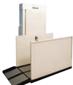
Vertical Platform Lifts