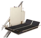
Inclined Platform Lifts