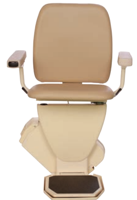
Pinnacle Standard Edition (SL600)