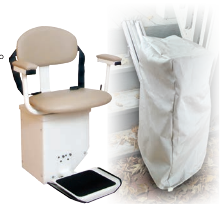
Weatherized Outdoor Model