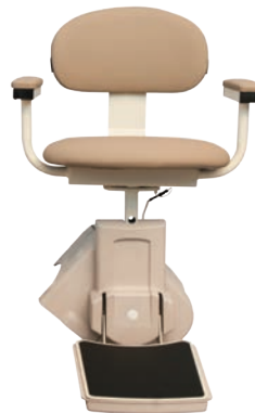
Alpine II Standard Model