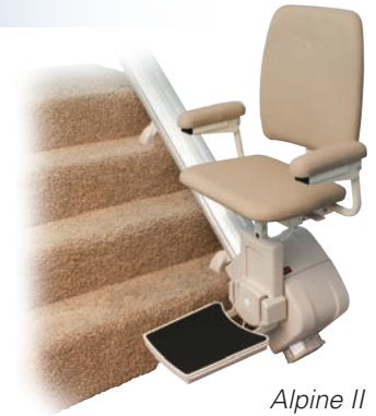
Alpine II Signature Model

Soft Start and Soft Stop moves the rider effortlessly between levels. Alpine's proven rack and pinion drive system continues to offer its high level of safety and dependability.