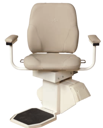
SL600HD with 25" wide seat