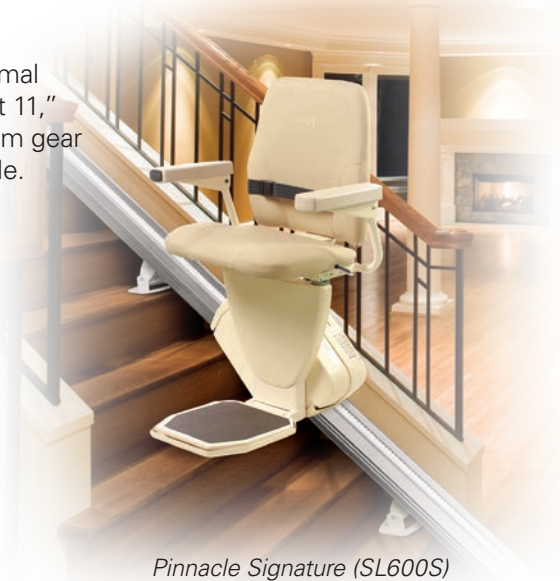
Pinnacle Signature (SL600S)