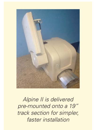
Alpine II is delivered pre-mounted onto a 19" track section for simpler, faster installation