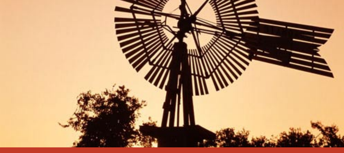
PLOUGHSHARES FUND CONTRIBUTOR LYNDE UIHLEIN