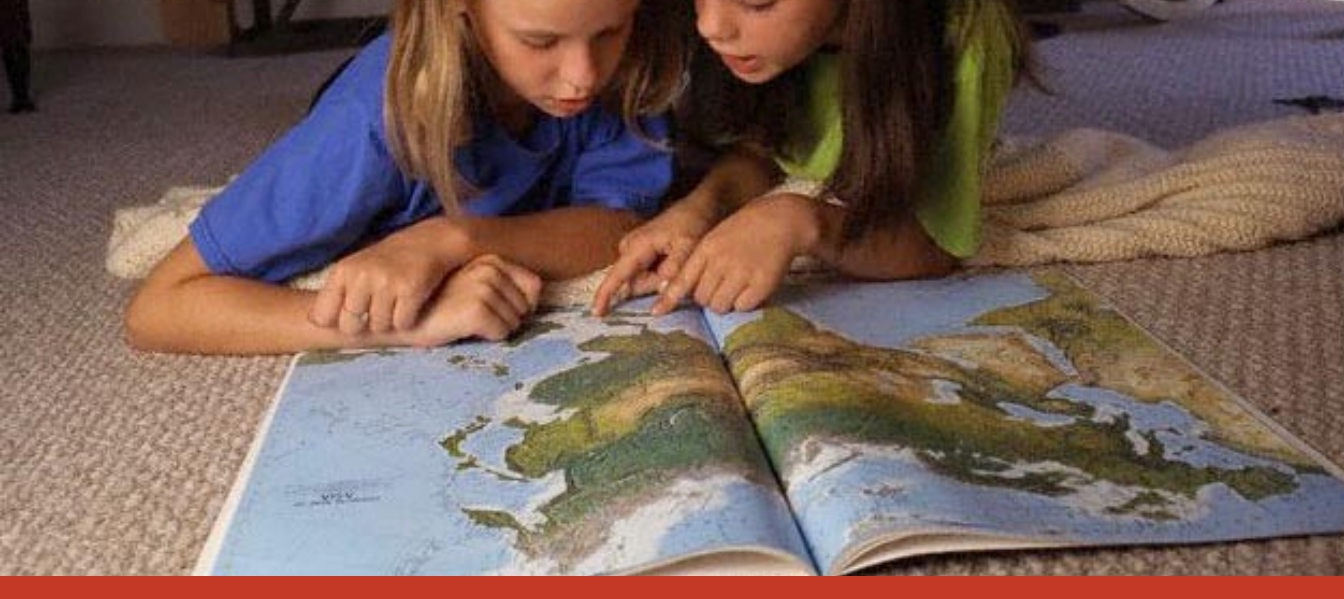
THE NUCLEAR-FREE LEGACY SOCIETY

For most of us, the goal of a nuclear weapons-free future will not be realized during our lifetimes, but we are no less determined to build a safer, more secure world for our children and future generations. In order to do so, Ploughshares Fund is building a permanent endowment capable of sustaining our efforts for as long as is necessary to achieve those goals. Thanks to a number of generous gifts, bequests and investments in Ploughshares' Pooled Income Fund, our endowment is currently valued at nearly $20 million. We are striving to increase that amount in order to ensure Ploughshares Fund's continued ability to support the creativity and leadership needed to address the complex problems of global security in the 21<sup>st</sup> century.