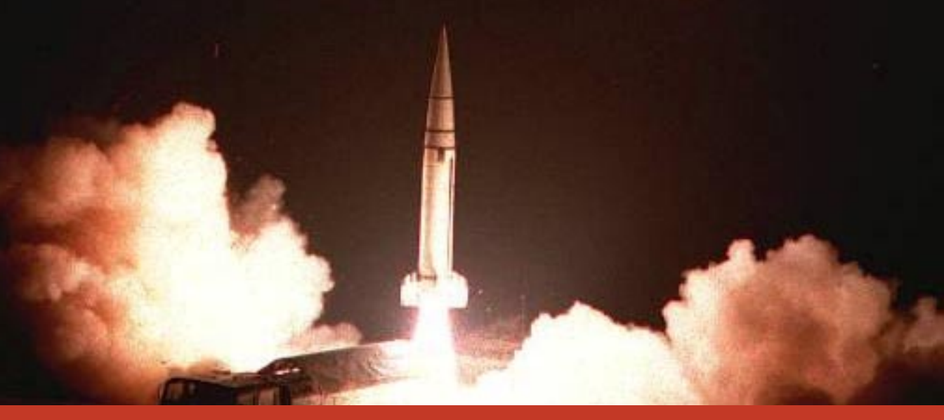
MISSILES AND SPACE

The U.S. is committed to beginning deployment of a missile defense system by September 2004, even though the system under development does not stand up to any serious technical, strategic or cost/benefit analysis.