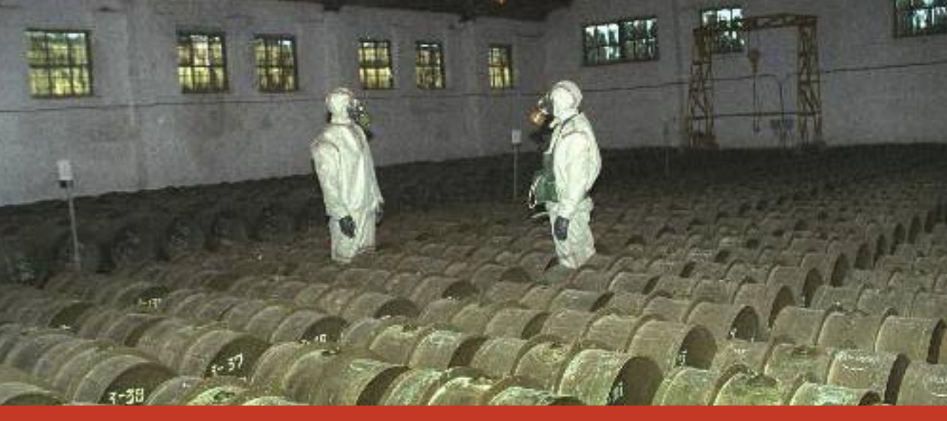
BIOLOGICAL AND CHEMICAL WEAPONS

As many as twenty countries are believed to possess or to be developing offensive biological and/or chemical weapons, but that number is only speculative, especially in the case of biological weapons.