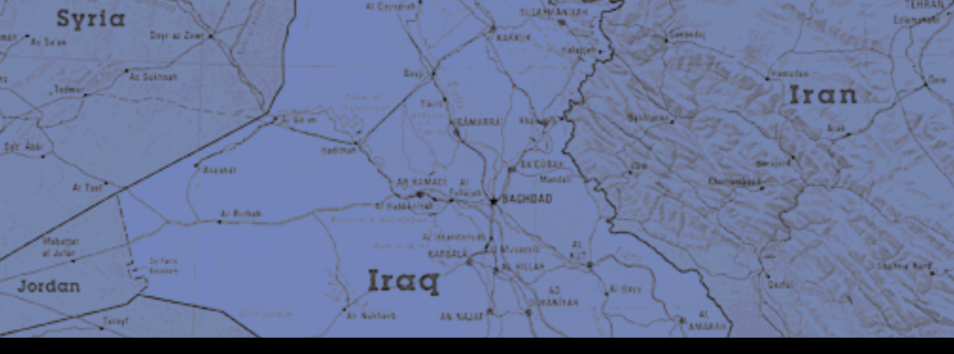
PLOUGHSHARES FUND 2002/03