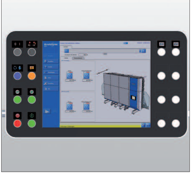
Modern speed'assembler control unit