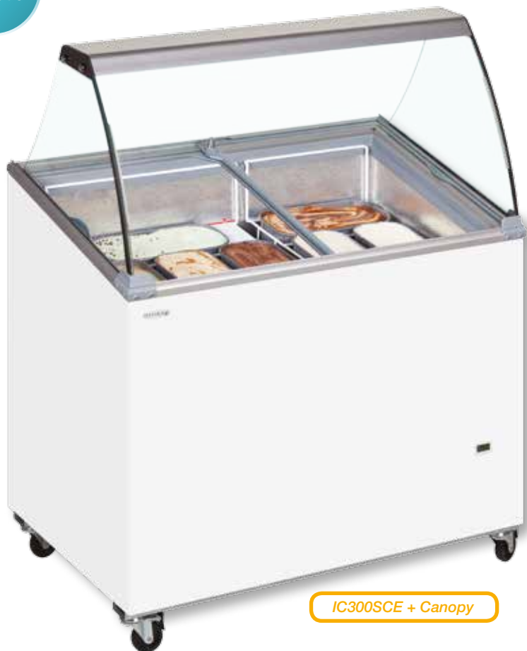
IC300SCE + Canopy