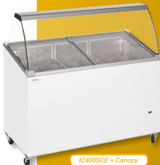
IC400SCE + Canopy