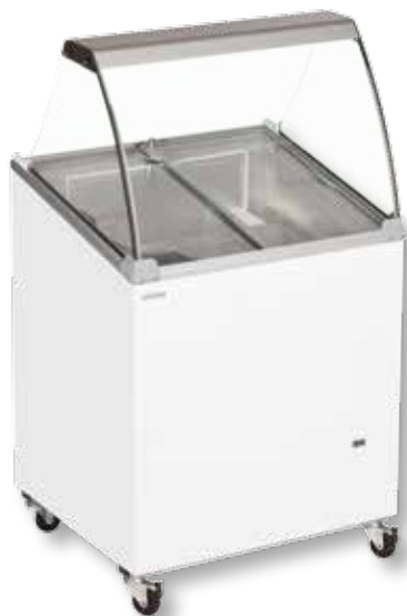
IC200SCE + Canopy

Temperature range . . . -14/-24°C Refrigerant . . . . . R404A Type of defrost . . . . . Manual Exterior finish . . . . . White Interior finish . . . . . Aluminium Power required . . . . . 13 Amp