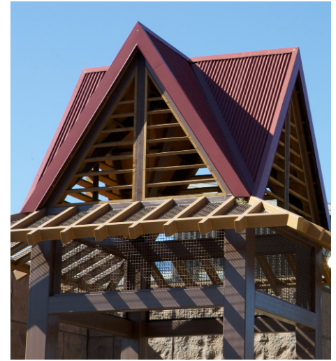
Denver Zoo, Denver, CO