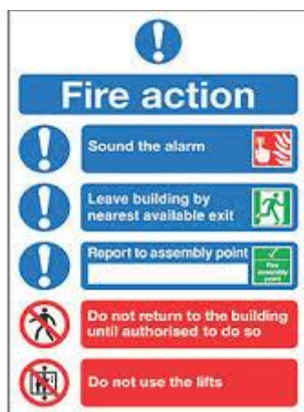
Diagram.1. Fire Instruction Notice

Fire Instruction Notices (see diagram 1 below) are displayed throughout the School buildings at prominent positions, detailing what to do in the event of a fire. All staff are expected to take reasonable care of their own safety and familiarise themselves with these emergency arrangements. If you are unsure you should talk to the Fire Safety Manager.