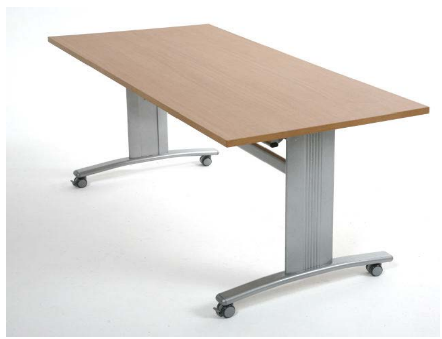
Table tops are folded and locked into the horizontal position with a simple hook bar mechanism