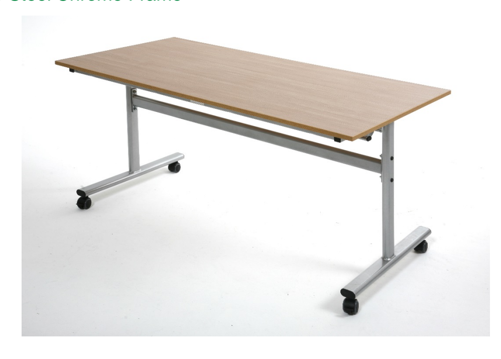
Table tops are folded and locked into the horizontal position with a simple hook bar mechanism