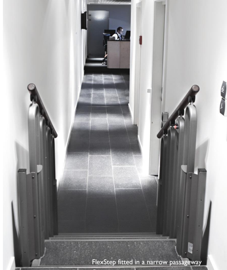
FlexStep fitted in a narrow passageway