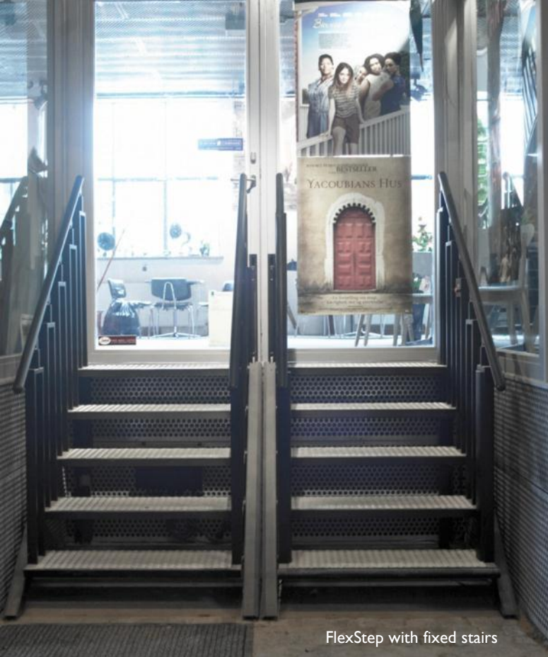
FlexStep with fixed stairs