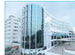
Asian Institute of Medical Sciences, Faridabad

Asian Healthcare is one of the leading healthcare chains in the country. In a short span of 9 years, it has created a niche for itself through its philosophy of affordable, accessible and best available healthcare for people close to where they live. The group's flagship hospital, Asian Institute of Medical Sciences, Faridabad continues to be India's premier healthcare destination at par with the best in the world.