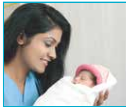
Asian Centre for Mother & Child, IVF