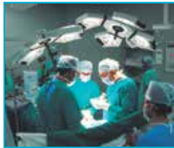
Asian Centre for Advanced Surgery