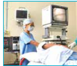
Asian Centre for Gastroenterology