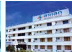
Asian Vivekanand Super Speciality Hospital, Moradabad