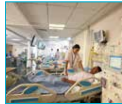
Asian Centre for Kidney Diseases & Transplant Medicine