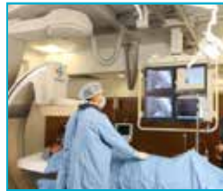
Asian Advanced Heart Centre