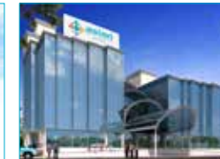
Asian Institute of Medical Sciences, Noida