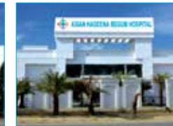
Asian Haseena Begum Multi Speciality Hospital, Sambhal