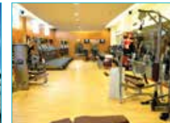
Equilibrium PRO, Sec- 21A, Sec - 9, Sec - 16A, Faridabad