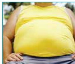
Asian Centre for Bariatric & Metabolic Surgery