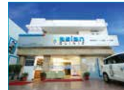
Asian Clinic, GK-1, Palwal, Faridabad