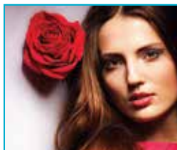
Asian Centre for Aesthetic Surgery & Medicine