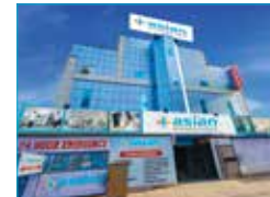
Asian Yamuna Vihar Multi Speciality Hospital, New Delhi