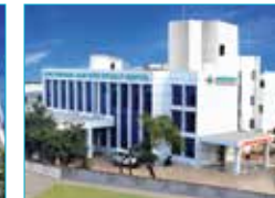
Asian Dwarkadas Jalan Super Speciality Hospital, Dhanbad