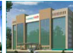
Asian Fidelis Multi Speciality Hospital, Greater Faridabad