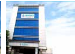
Asian City Hospital, Patna