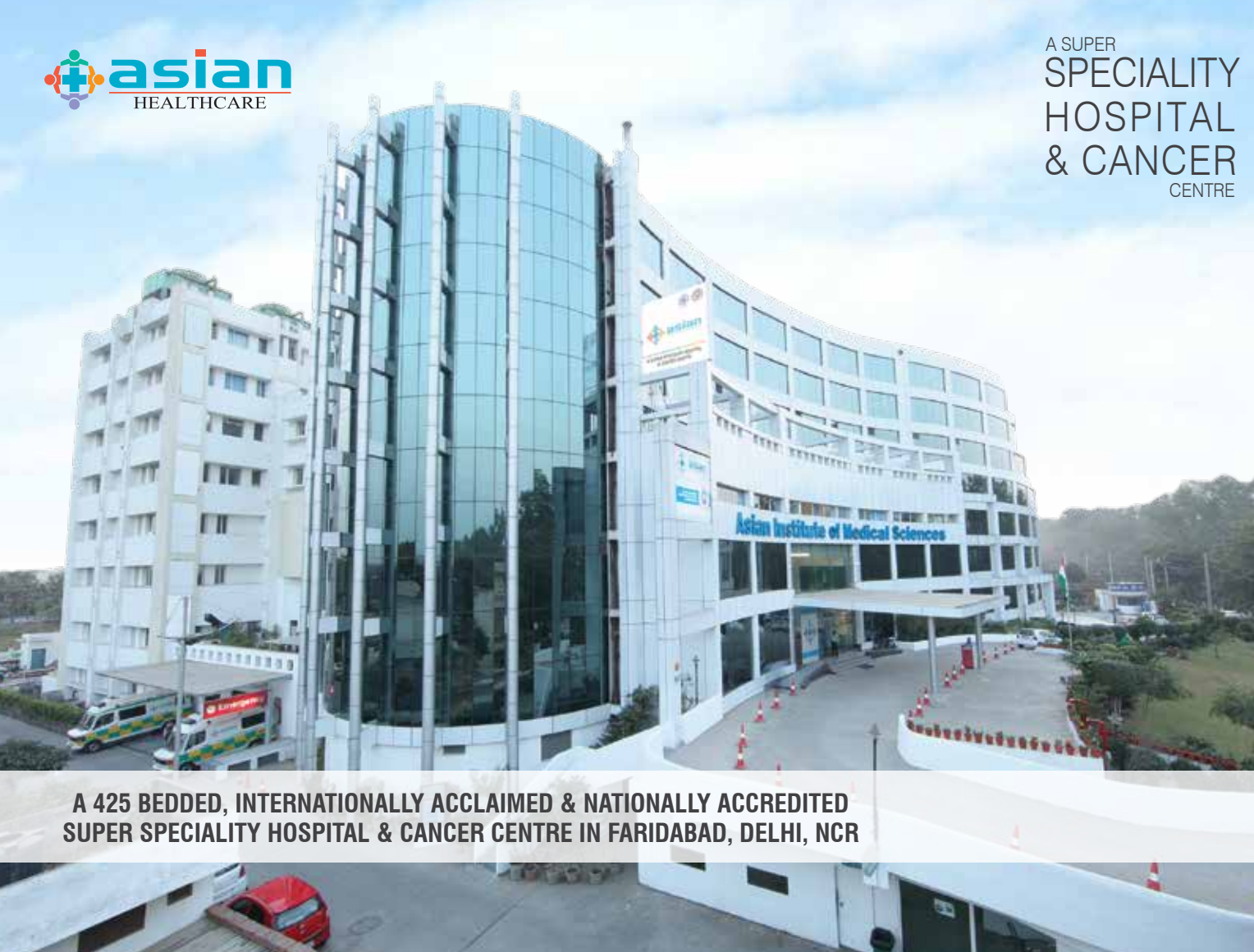
A 425 BEDDED, INTERNATIONALLY ACCLAIMED & NATIONALLY ACCREDITED SUPER SPECIALITY HOSPITAL & CANCER CENTRE IN FARIDABAD, DELHI, NCR