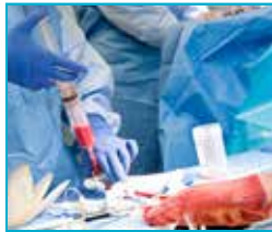
Asian Centre for Bone Marrow Transplant