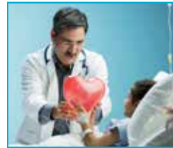
Asian Centre for Paediatric Cardiology & Surgery