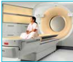
Asian Centre for Advanced Imaging