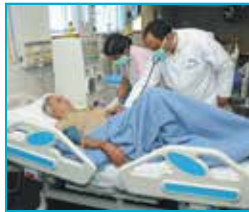
Asian Centre for Urology & Kidney Transplant