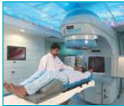
Asian Cancer Centre