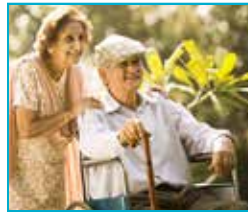
Asian Centre for Bone & Joints