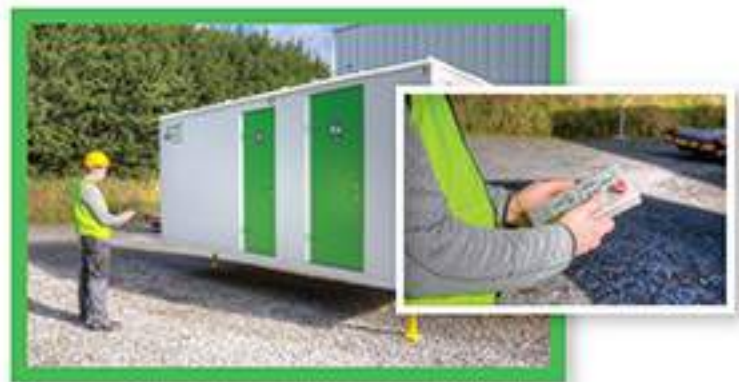
Wireless Remote Control System