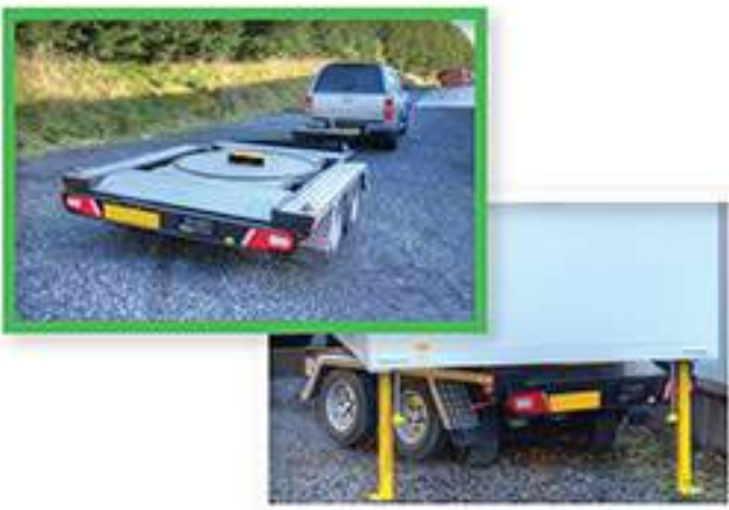
Automatic Steering For Picking Up Unit