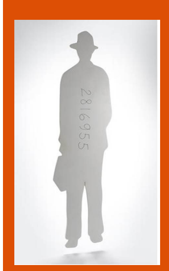
Jonathan Borofsky (b. 1942) Flying Man with Briefcase, No. 2816955 $16,000, April 2014