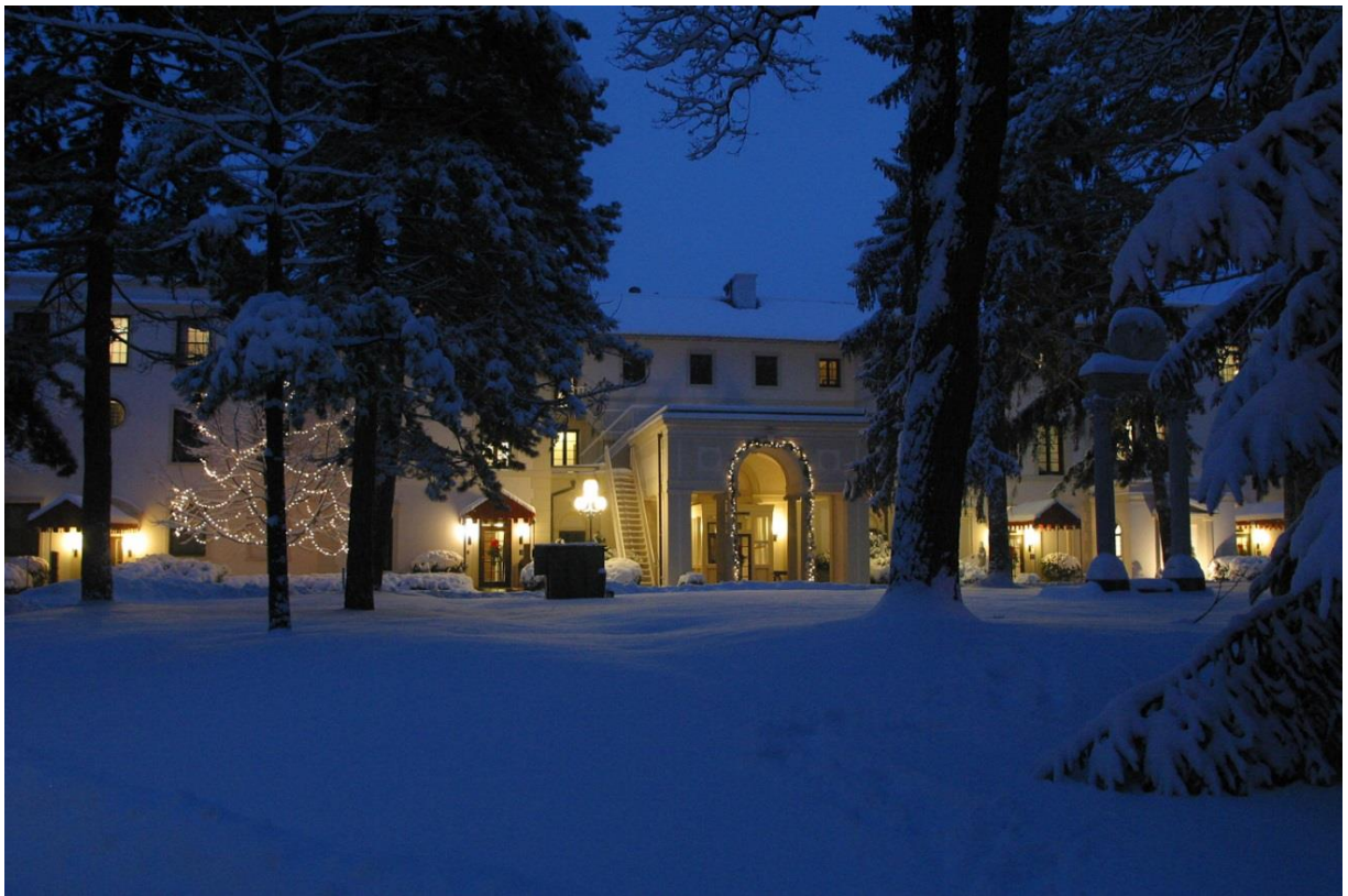
A haven of hospitality beneath a blanket of snow