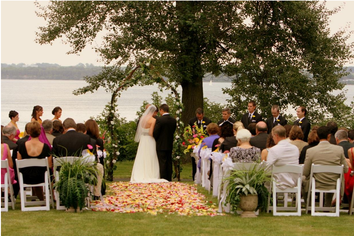
A beautiful ceremony on the bluff overlooking Seneca Lake