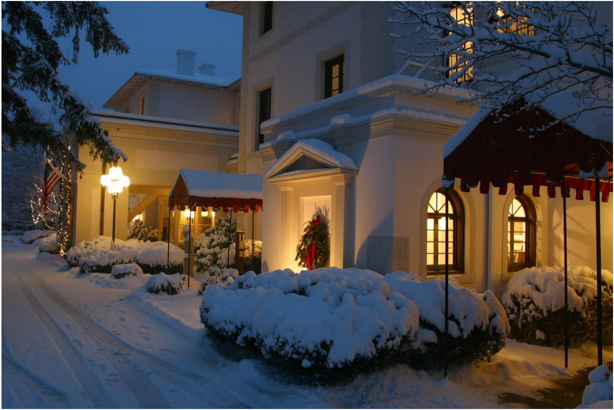
The “warmth of winter” for Christmas, New Years, winter holidays and romantic getaways