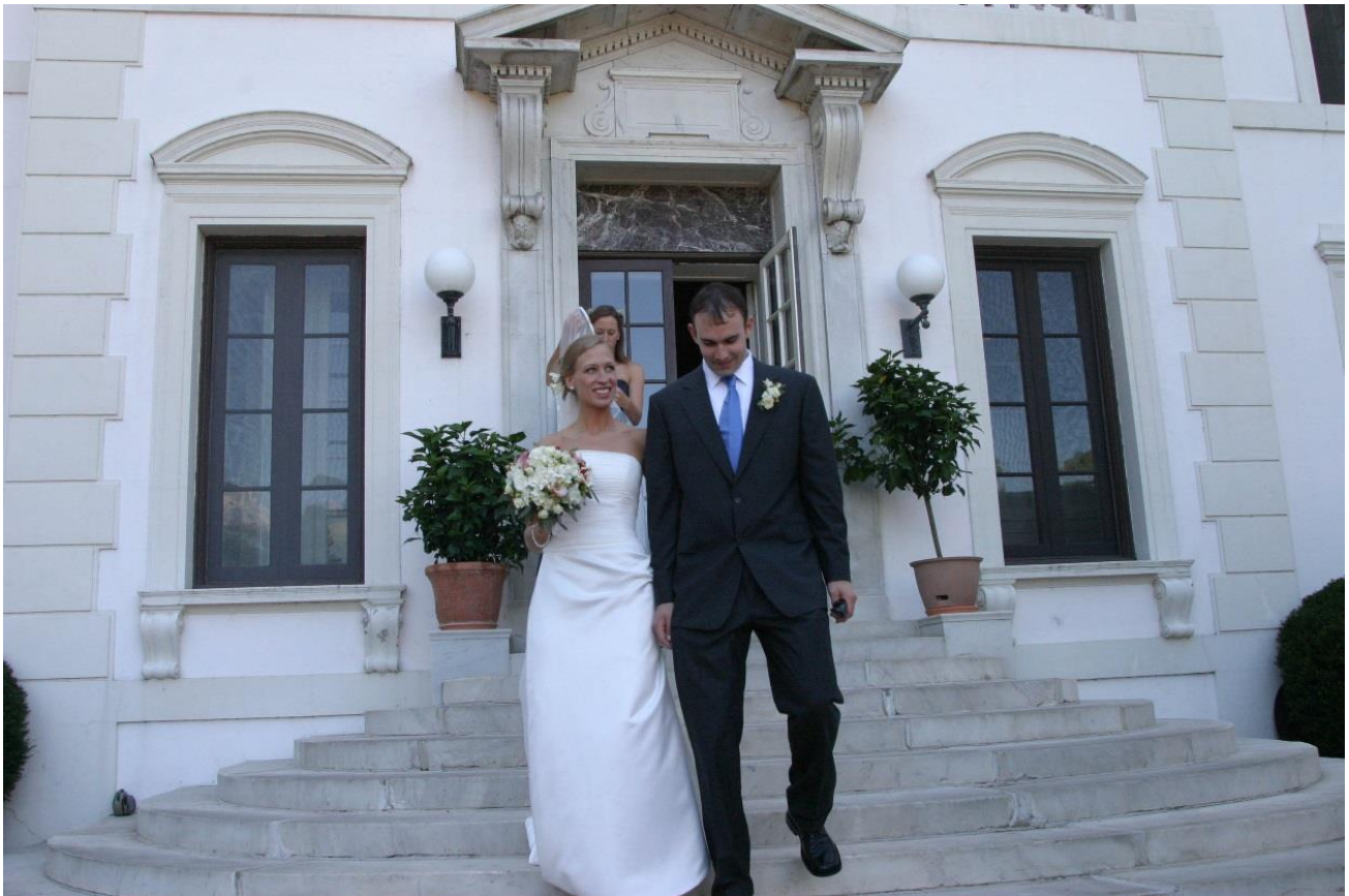
The happy couple descend to The Terrace to join their guests.