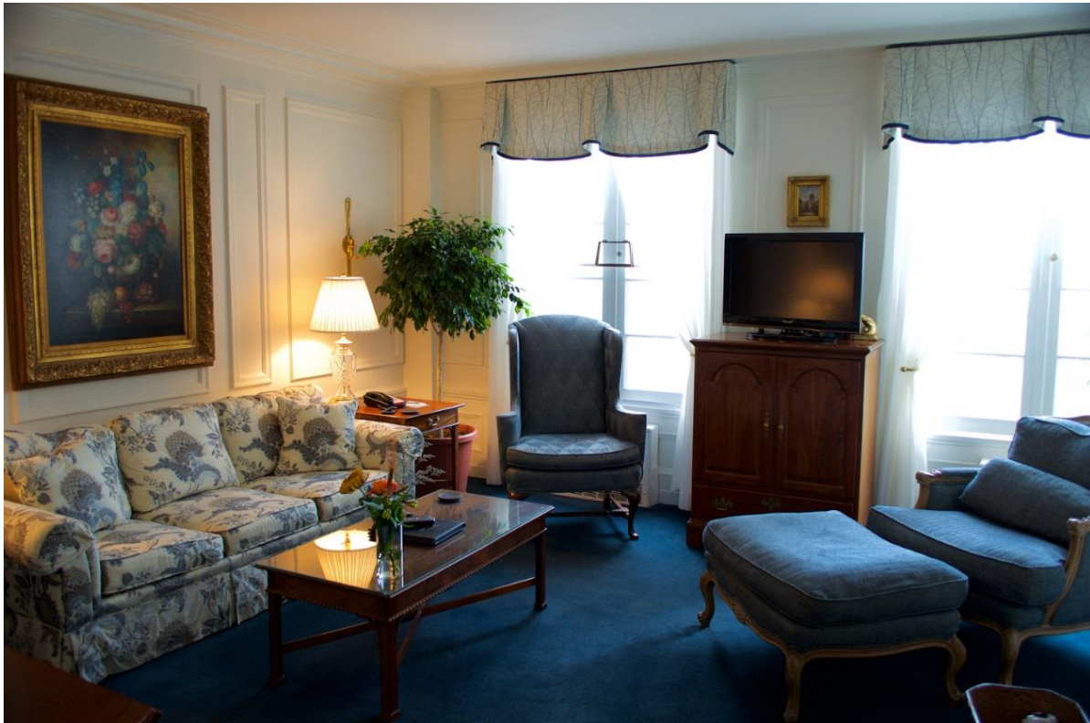
The living room of the “Classic Suite” has a center view overlooking the gardens. The resort has 29 Stickley furnished accommodations, each uniquely appointed (ten suites have two bedrooms).