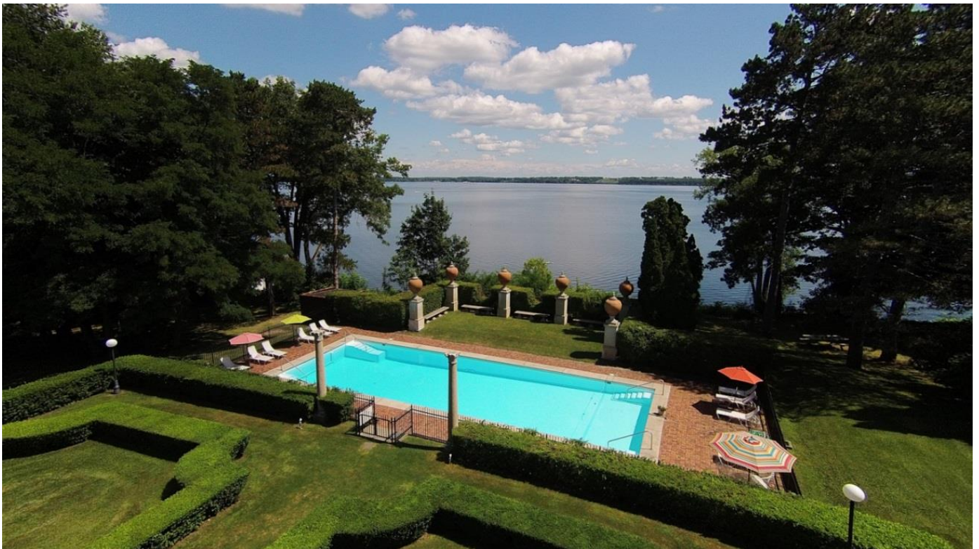
The 70' swimming pool overlooks Seneca Lake which is 37 miles long and 642 feet deep. Seneca Lake is noted for great fishing, especially lake trout, and is at the epicenter of New York State's Finger Lakes Wine Country.