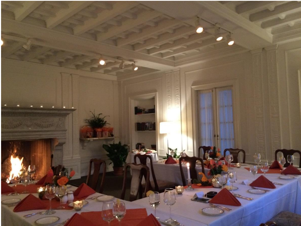
Enjoy the cozy comfort of the wood-burning fireplace.