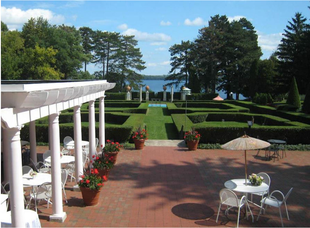
The “lawn furnishings” with a privet hedged formal garden and pool were completed in 1930.