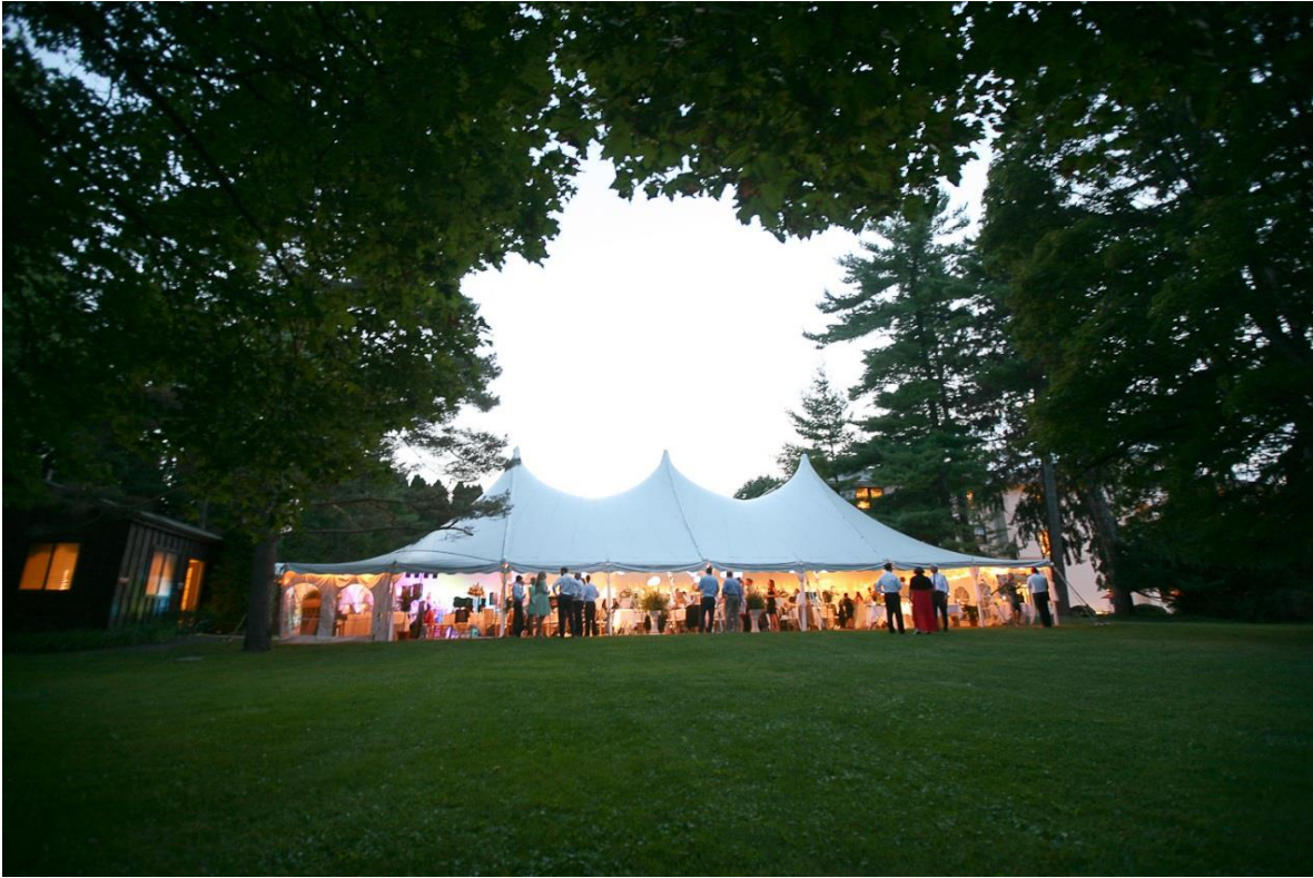
South Lawn Tent Pavilion is for dinner parties, weddings and many festive events of up to 150 people.