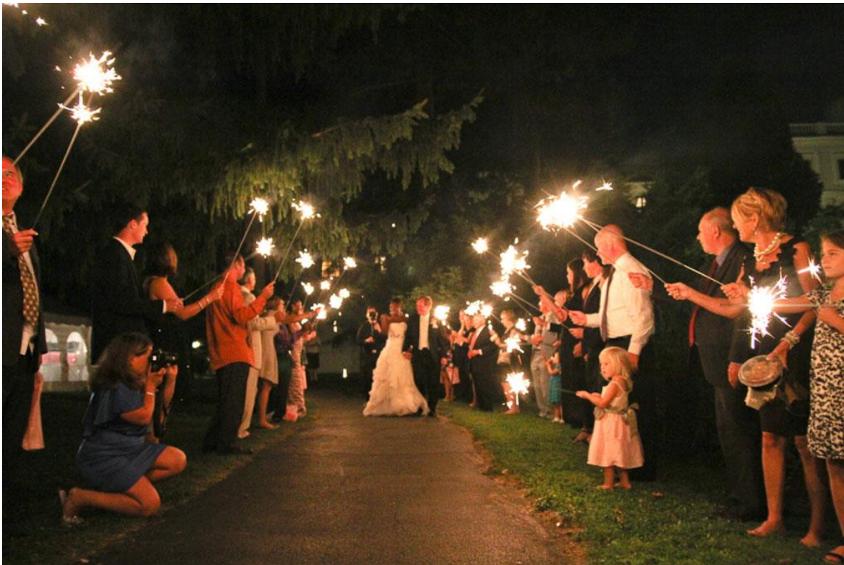
The beautiful couple bid their family and friends farewell amidst dazzling sparklers.