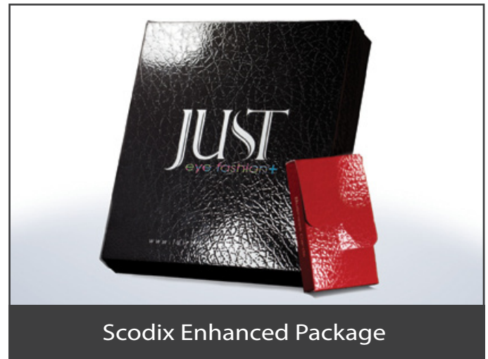
Scodix Enhanced Package