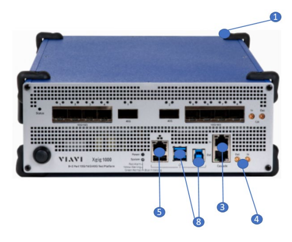
Figure 3. Xgig 1000 chassis