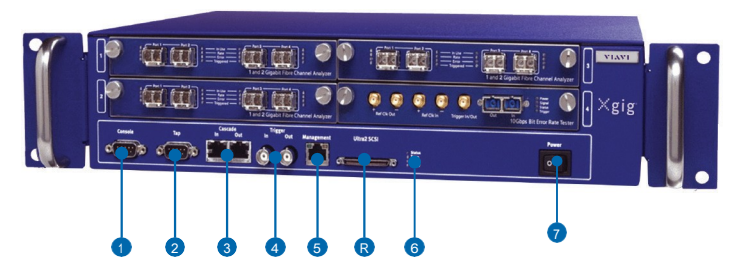
Figure 2. Xgig 4-slot chassis and blade options