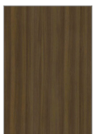
Dark Springfield Oak Y2110-Q3

For further information about these five new Decofoils please email: marketing@davidclouting.co.uk