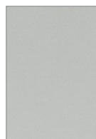
Light Grey Concrete KADR4-K9