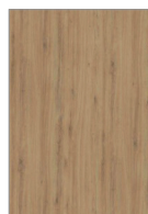
Natural Chalet Oak Y1610-Q5