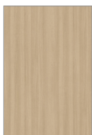
Light Springfield Oak Y2109-Q3