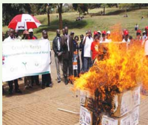
Burning "dummies" of fake pesticides