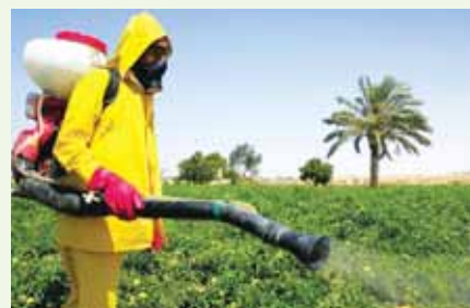
Applicator Project in Egypt