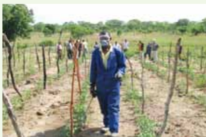
SSP in Zambia