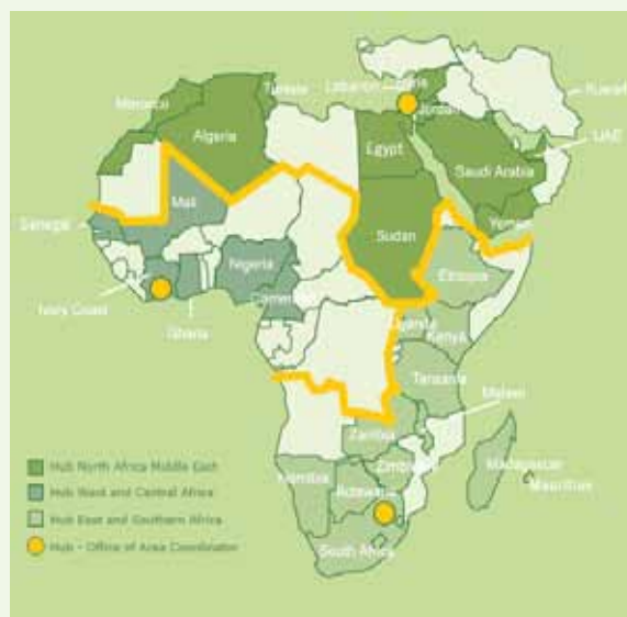
National CropLife associations and the regional hubs