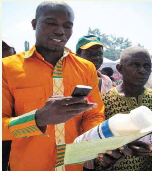
Farmer sending unique code from the Holospot ® to the local SMS platform and receiving authentication feedback

In Uganda it has been the International Centre for Soil Fertility and Agricultural Development (IFDC), the Grameen Foundation and other external stakeholders who are driving the launch of the project, which is now progressing towards formal launch in 2012.