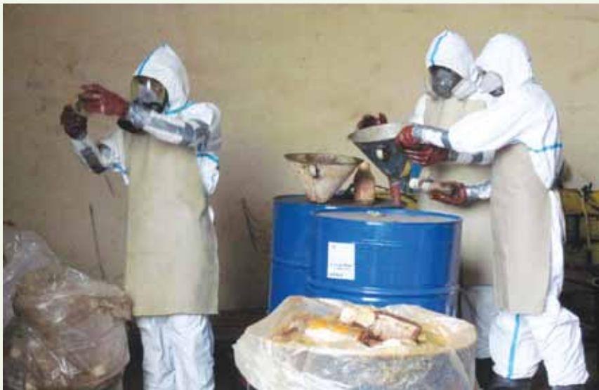
Repacking obsolete pesticides in Ghana

An effective model has been developed whereby CropLife International is able to move relatively rapidly to reduce the risk posed by obsolete pesticides in the public and private sectors, while multilateral agencies go through the longer process of acquiring funds and implementing disposal operations.