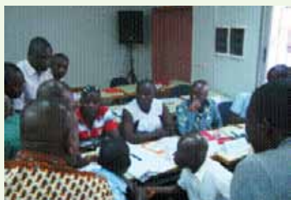
IPM Training in Côte d'Ivoire

A major breakthrough to broaden stewardship outreach was the establishment of the CropLife Africa Middle East website training centre, which is accessible on ( www.croplifeafrica.org ). All the training materials relating to ToT and IPM programs including trainee and trainer manuals together with technical subject matter items are now accessible online to certified trainers, and are available in several languages in the region, namely English, Arabic, French and Swahili.