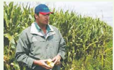
Biotech Farmers in Southern Africa