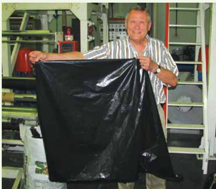
Refuse bags produced from recycled empty pesticide containers