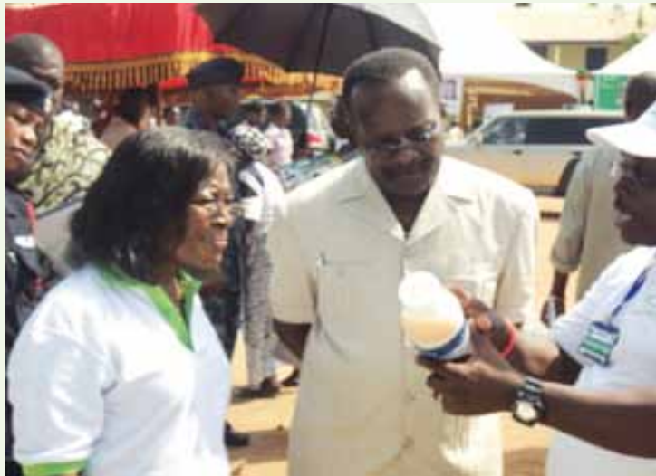
Mr. Kwasi Ahwoi, Minister of Agriculture in Ghana and Mrs. Ama Benyiwa-Doe, Central Regional Minister listening to the explanation of the Holospot ®

Finally the CropLife Quality Scheme saw its first public rollout in December in Ghana. As expected many external stakeholders received this project very positively. Particular interest was noticed with cocoa buying companies and with all those stakeholders working for an improved cocoa production in West Africa.