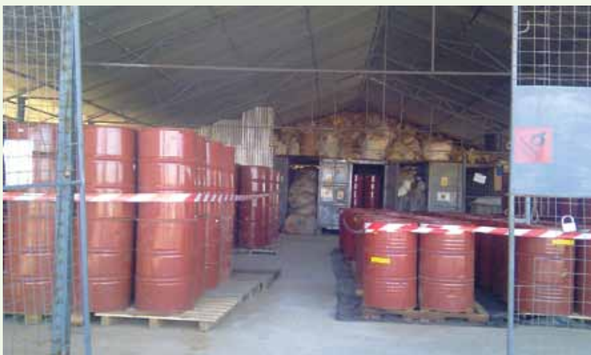
Repacked obsolete pesticides in Kenya awaiting disposal