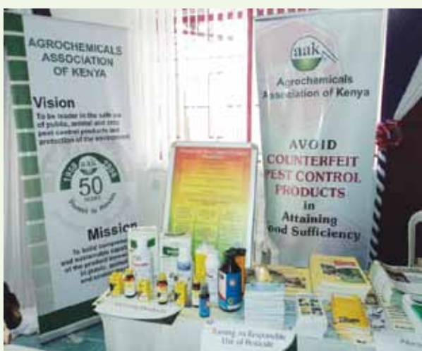
Samples of fake and genuine products

A particular highlight was the local team's contribution to the national Anti-Counterfeiting Day with a well-prepared float and the spectacular action of burning some (dummy) fake pesticides, which was captured and reported by the daily TV news.