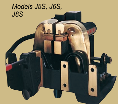
Models J5S, J6S, J8S