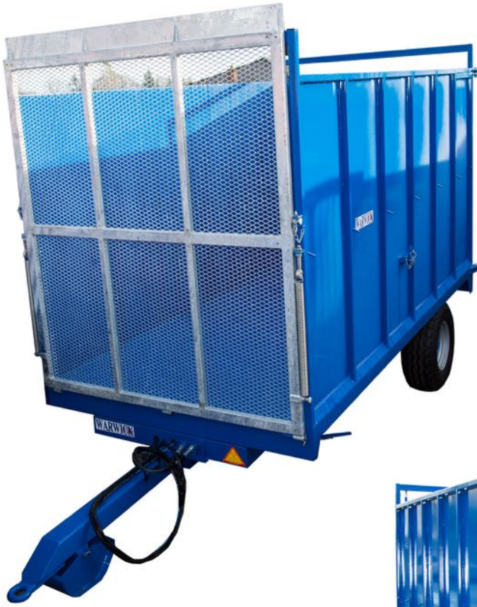
Spring assisted one piece loading ramp