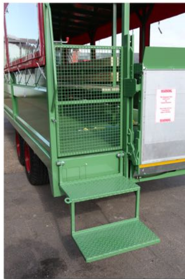
Folding access step