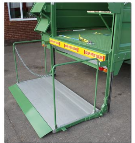
Wheelchair lift option