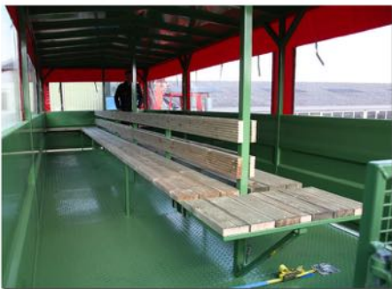
Seating for up to 30 people