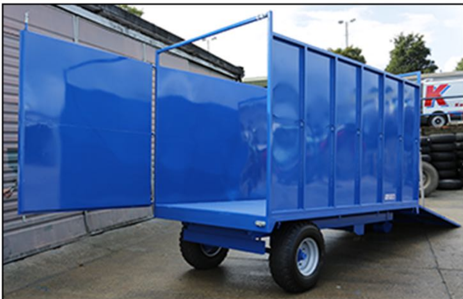
Side opening rear door