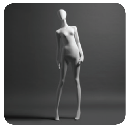
JG6 (standard form)