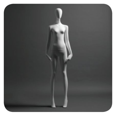
JG5 (standard form)