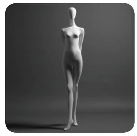
JG7 (standard form)