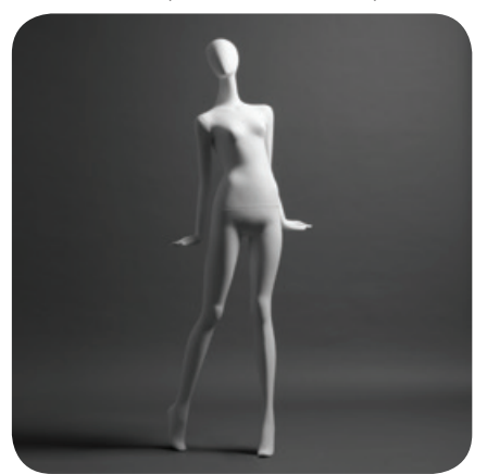
JG8 (standard form)