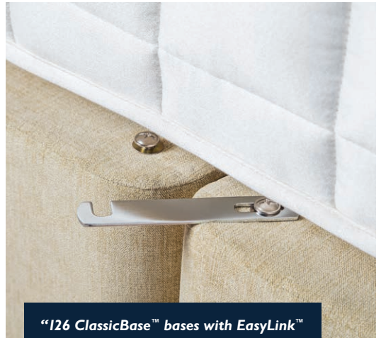
“126 ClassicBase™ bases with EasyLink™ linking bars were specified.”