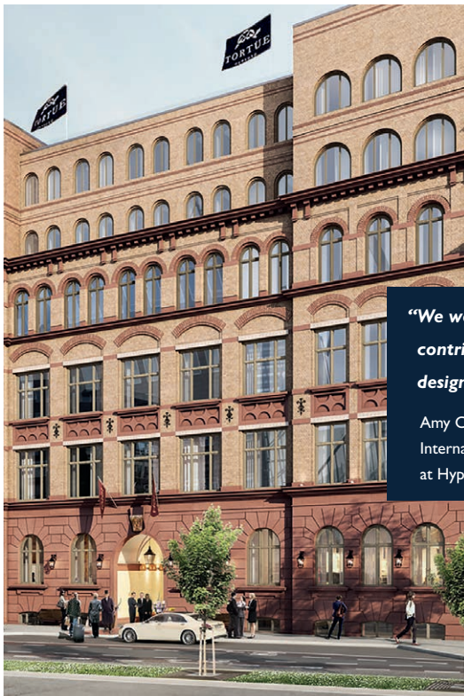
“We were delighted to be asked to contribute to such an innovative, design led Hotel development.”