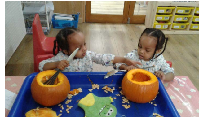
Learning that some things are mine, some things are yours.