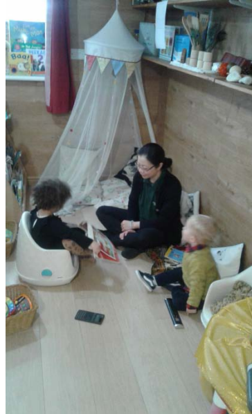
...catching up with my old Baby Room...