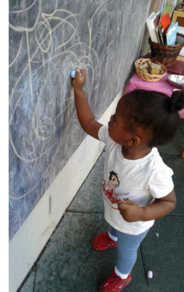
The children can tell us what they are drawing or writing. Parents and carers, it's usually you 😊