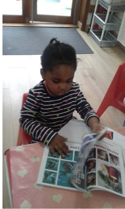
Introducing books and how to handle them.

Stacking isn't easy! It requires great concentration, perseverance and motor-skills!