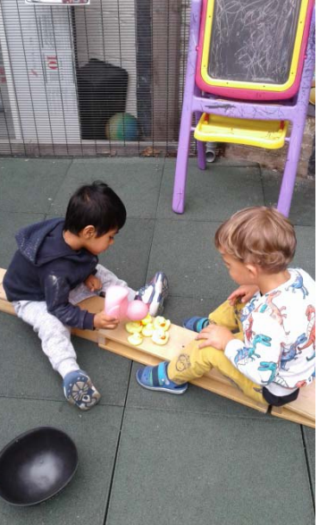
Making friendships, learning maths concepts and enjoying physical, outdoor play.