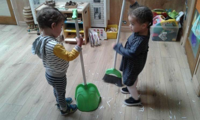
Promoting British Values: Rules (tidy-up), cooperate and look after our things.