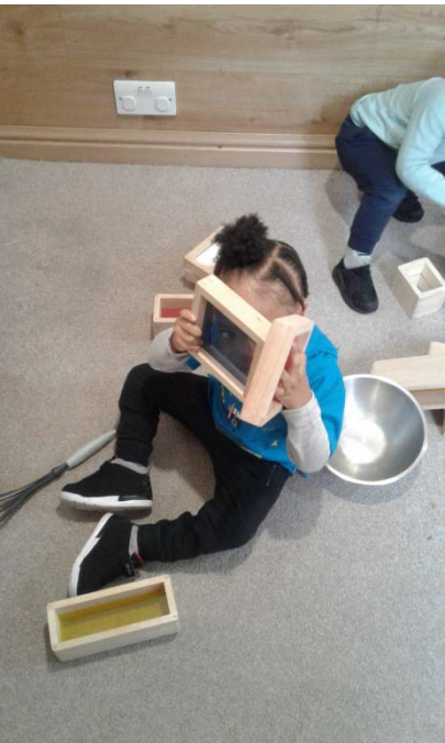
Things look different...