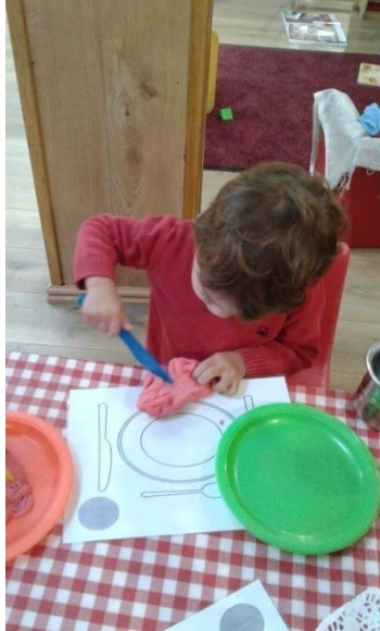
Learning life-skills through play. Tweenies butter their own toast at breakfast!