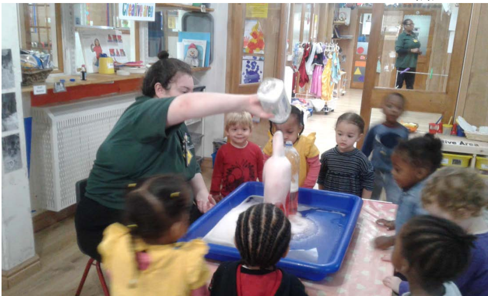
Lemonade Fountain: a multi-sensory activity which wows the children. Visually it changes, it smells lovely, it feels foamy & bubbly and it sounds fizzy and sizzles... This helps the children be together, take turns, understand and predict, and learn new sounds and words.