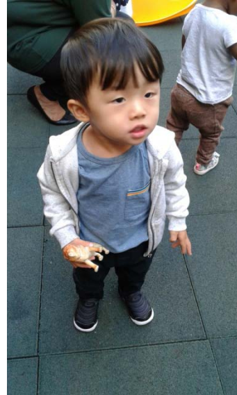
Making animal sounds is fun; it increases the voice-range, vowels & consonants, pitch and volume which contribute to oral communication.