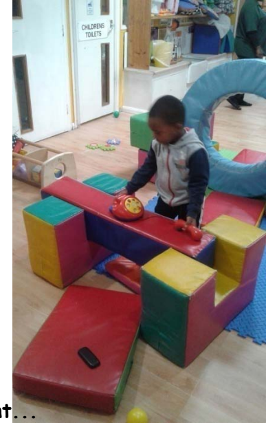
...it also means we get to share equipment...