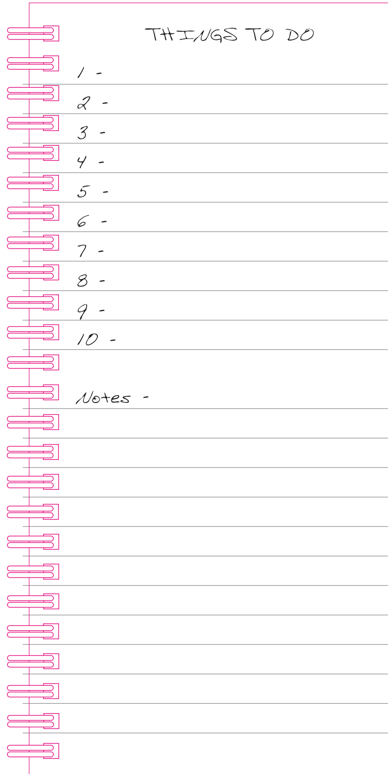
Each sheet front