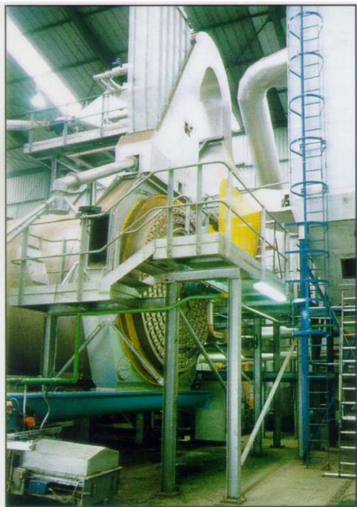
Discharge End 3.25m dia STRD

The Mitchell Steam Tube Rotary Dryer is manufactured under license from Davenport Machines of Iowa, USA.