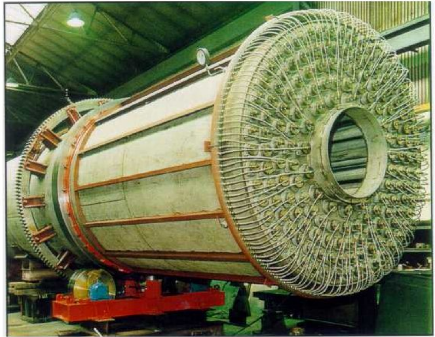
2.8m dia x 19.6m STRD

The STRD can be supplied with peripheral or centre discharge dependent upon whether inert gas sealing or solvent recovery is required. The peripheral discharge dryer usually employs parallel vapour flow whereas counterflow is used in the centre discharge unit.