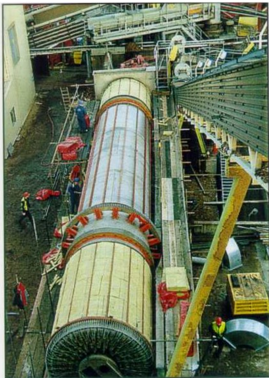
Drying of Papermill sludge