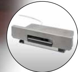
Dead Man's Foot Controls