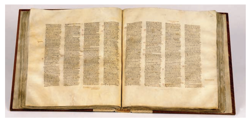
The Codex Sinaiticus is the oldest surviving copy of the complete New Testament. It was handwritten 1600 years ago.