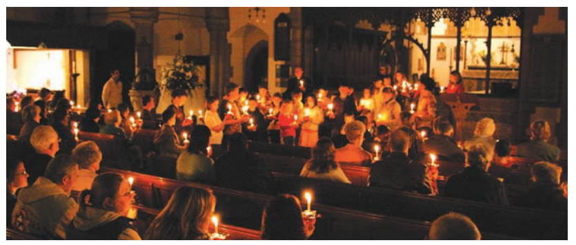
A Christingle service

The events of the Christmas story can be found in the Bible: Matthew I and 2, Luke I and 2