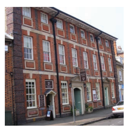
The Cowper and Newton Museum, Olney

There are many other parish churches in Milton Keynes and the surrounding villages, some very old and some quite new. All are worth a visit.