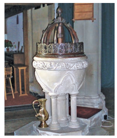
A font, used for infant baptism in an Anglican church

- Ajala Oluwatobi (Holding Forth the Word Church)