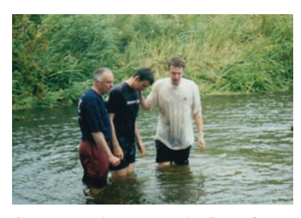
An open air baptism in the River Ouse, near Wolverton

A Christian then shows they belong to God by the way they live their life. A Christian's actions should show they belong to God and want to please him by living according to what he says in the Bible. His Spirit should shine out of them in all they do; his love, joy, peace, patience, kindness, goodness, faithfulness, gentleness and self-control should be evident to all.