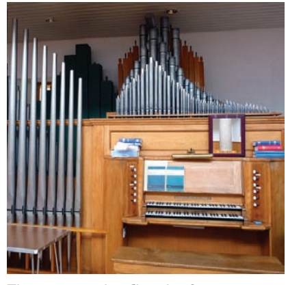
The organ in the Church of Christ the Cornerstone

Churches have many different styles of worship. Some use organs or orchestras, choirs and special robes. Others express their love to God in contemporary popular music styles involving worship bands with guitars, drums and keyboards. The Salvation Army have military style bands, while the Quakers prefer to sit in silence. Christian services often include holy communion and normally a service will include a sermon where a preacher will explain part of the Bible and apply it to everyday life.