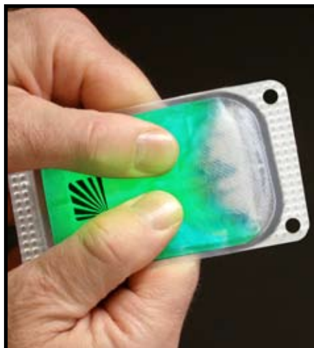
Step 2: Knead until illuminated