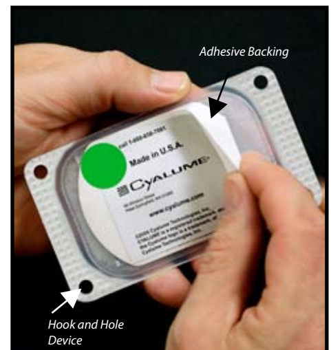
Step 3: Peel to reveal adhesive backing

CYALUME® and the Cyalume Light Technology logo are registered trademarks of Cyalume Technologies, Inc.