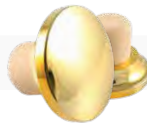
CUSTOM METAL EFFECT