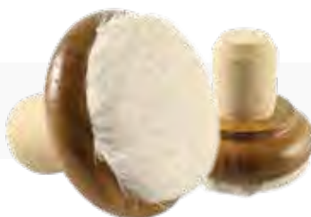
FULL CUSTOM MILLED