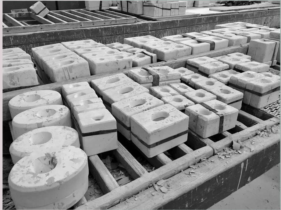
Moulds on the casting bench

Trading now as Ceramic Inspirations, the pottery is adapting to the ever-changing needs of our customers. Working with sister company Cardew Design, exciting new creations are being added to the collection offering something fresh for enthusiasts across the UK.