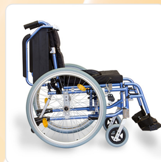
Flip Back Armrests