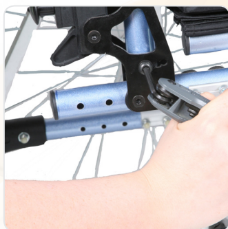
Back Angle Adjustable