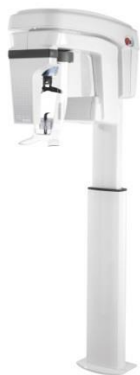
CS 8100 Digital Panoramic System

Products such as Intraoral Cameras (CS 1200/1500/1600) , X-Ray units (CS2100/CS2200) , Digital Intraoral Radiography (RVG 5100/6100/6500) , Computed Radiography (CS 7400/CS 7600) , Digital Extra-oral radiography (CS8000C/CS8100/CS9000/CS9300) systems , Cone Beam CT's (CBCT) and software such as CDIS/LOGICON/COMMUNICATOR are all available in the Carestream Dental portfolio offered by JNC International Ltd