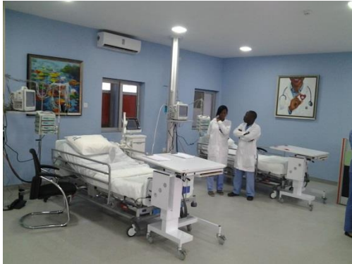
ICU at Babcock University Teaching Hospital, BUTH, Ilishan, Ogun State