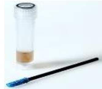
Protein Test Instrument Surface