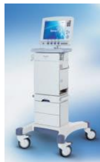
Servo-i™ Ventilator Universal (Adult and Infant) ICU Ventilator with Mini Compressor