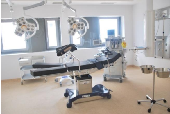
Operating Theatre suite, Ibom Specialist Hospital, Uyo, Akwa Ibom State