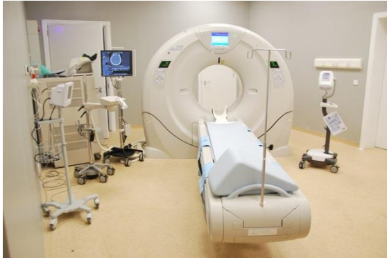
Toshiba Aquilion One™ 640- Slice CT, Ibom Specialist Hospital, Uyo