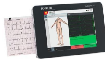
Cardiovit FT-1 ECG