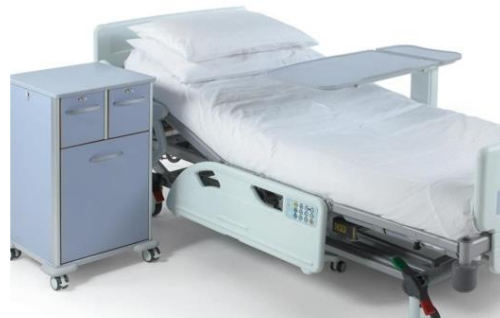
Hospital Ward with Enterprise CR5000 Bed, Overbed Table and Bedside Locker