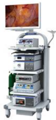
Visera Elite Surgical Imaging System