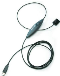
RVG 5100 Dental Radiography Flat Panel Detector