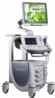
Xario 200 (4D, Echo, ApliPure+ Elastography options available)

Sonosite’s ranges of “Point-of-Care” Ultrasound Equipment, including the rugged M-Turbo™ , are designed to save lives, increase patient safety and improve doctor efficiency. Industry-leading for their robustness and image quality combined, they can be used across range specialties, particularly military medicine