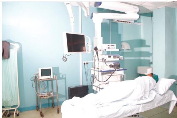
Endoscopy suite, University College Hospital, Ibadan