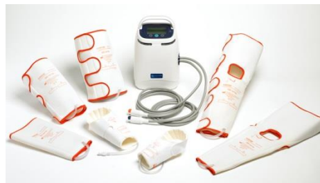
Flowtron DVT Prophylaxis Pump