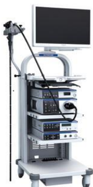
Evis Exera III GI Video Endoscopy System

These innovative technologies help facilitate more accurate diagnosis and treatment, simplify setup and reprocessing, improve workflow, and link patient and department information to the hospital's information network through smart technologies with advanced levels of sophistication and integration.