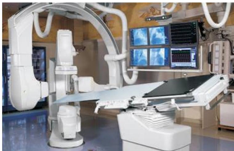
Infinix-I Hybrid Catheterization Suite

With our experience of building and equipping worlds-class cardiovascular centres in Nigeria, JNCI are the experts you can trust to guide you through the range of Cathlab equipment and help you build the cardiovascular centre of your dreams. We have currently installed the Infinix-i Hybrid Catheterization Suite at the University College Hospital, Ibadan; Ibom Specialist Hospital, Uyo and Babcock University Teaching Hospital, Ilishan, Ogun State.