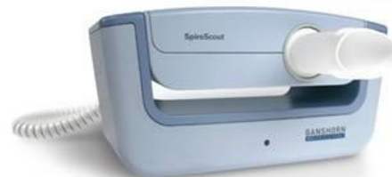
SpiroScout – Complete Lung Function Ultrasonic Measurement