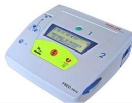
FRED Easy Fully Automated AED