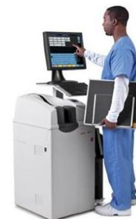
Classic CR (Mammography & X-Ray Digitizer)