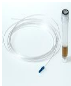
Protein Test Flexible Endoscope