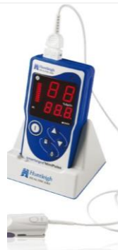
SmartSigns MP1 MiniPulse Oximeter