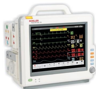
Truscope Elite Patient Monitor