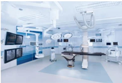
System Integrated (Digital) OR

Maquet VARIOP is an industrially prefabricated room system for the flexible extension of operating rooms and intensive care rooms. The fully-integrated modular system adapts to all spatial conditions and is suitable for new buildings as well as modification and expansion projects.