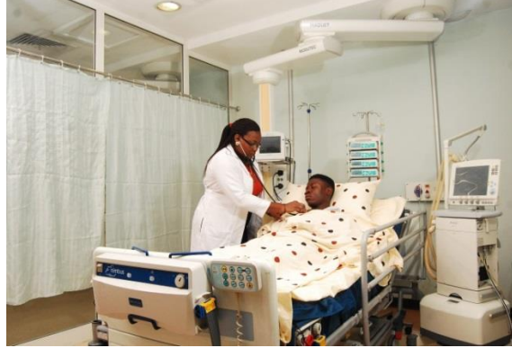
ICU at Lagoon Hospital, Apapa, Lagos