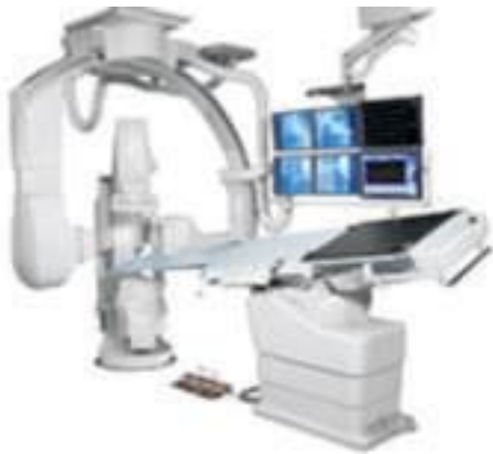
Ceiling mounted Cathlab

Toshiba have worked hand-in-hand with leading clinicians to develop a Cathlab range called Infinix-i™ range (" Best in Klas™ Award winner 2014), which comes in Hybrid, single or dual plane, floor or ceiling mounted variations, with more cardiac and vascular/periphery options to meet the varied access, coverage and workflow demands of the modern Cardiology Department without compromising on image quality.