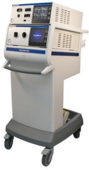
Thunderbeat Tissue Management System