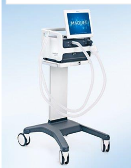
Servo- Air™ Ventilator