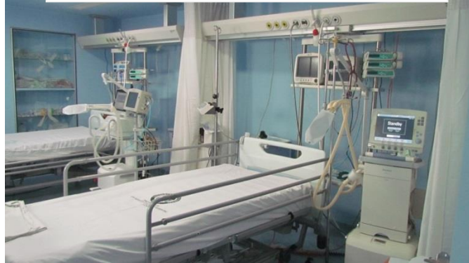
ICU at University College Hospital, UCH Ibadan