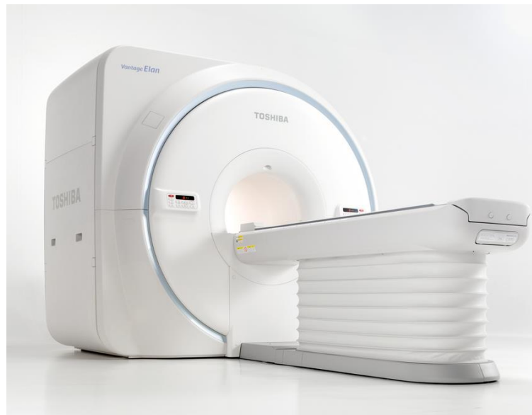
Toshiba Vantage Elan 1.5 Tesla MRI

Moreover, the Vantage systems are the only systems available with a complete suite of contrast-free MRI Angiography (MRA) technologies, which works well for diabetic patients or those with renal insufficiency who are not suited to standard MRI techniques. This is also useful for the Nigerian market where getting good quality reagents in a timely manner may be difficult and affordability cannot be guaranteed.