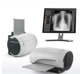
Vita Flex CR (X-Ray Digitizer)

The Classic CR System is customized to streamline workflow for higher productivity and patient throughput. It is enabled to print Digital X-ray and Mammography images.