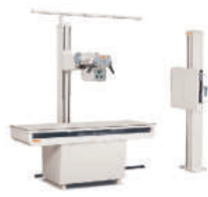
Ascend Ceiling mounted X-ray