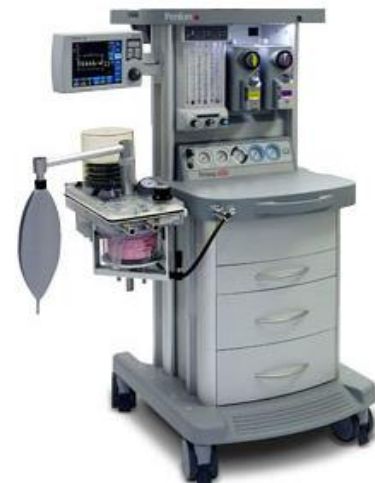
Prima 450 Anaesthesia Systems