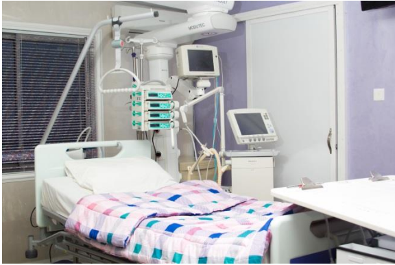
ICU at Paelon Hospital, Lagos