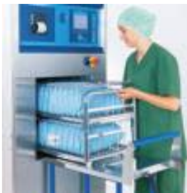
HS33 100Litres Steam Autoclave