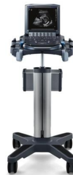
Sonosite M-Turbo Point of Care Ultrasound System