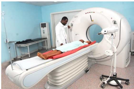
Toshiba 128 Slice CT scanner, LUTH, Idi-Araba