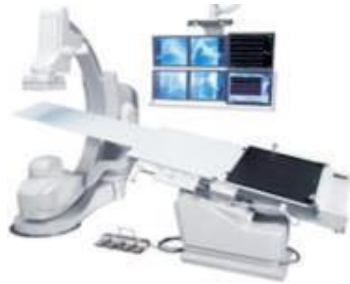
Floor mounted Hybrid Cathlab