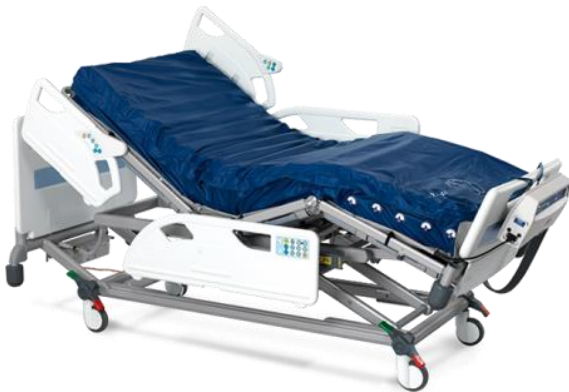
Nimbus 4 Pressure Relieving Mattress