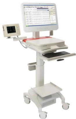
Cardiovit CS-200 Office ECG