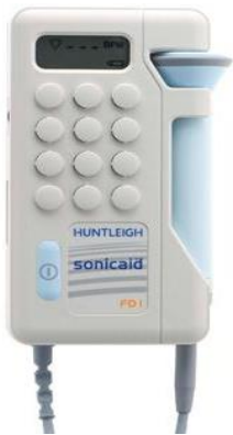
Sonicaid FD1 Fetal Doppler

Huntleigh Diagnostics is a leading global provider of innovative and high quality diagnostic medical equipment for healthcare professionals. JNCI can proudly boast of Huntleigh's world leading brands such as Sonicaid, Dopplex and Smartsigns, covering healthcare requirements in obstetrics, vascular assessment and patient monitoring.