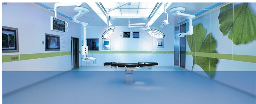
Maquet VARIOP fully-integrated modular System