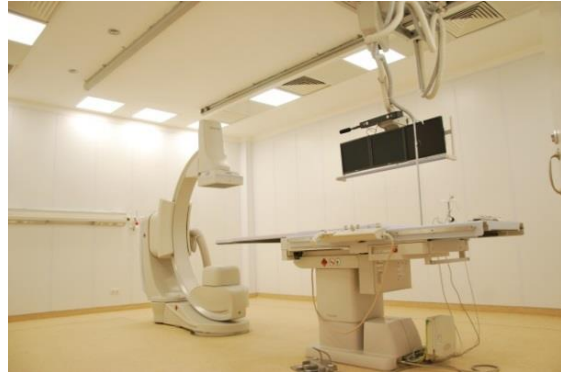
Toshiba Infinix- I Cathlab Suite, Ibom Specialist Hospital, Uyo