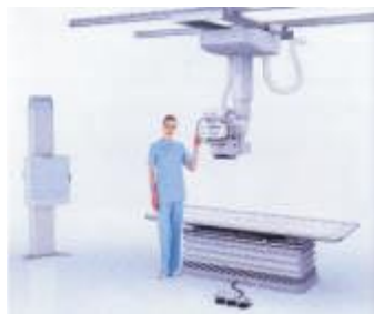
Radrex Ceiling Mounted X-ray