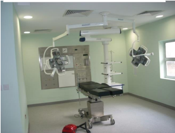
Operating Theatre Suite, Lagoon Hospital, Apapa, Lagos