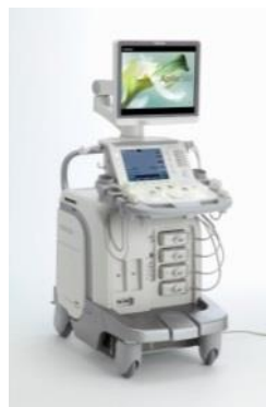
Aplio 300 with Echo Micropure options