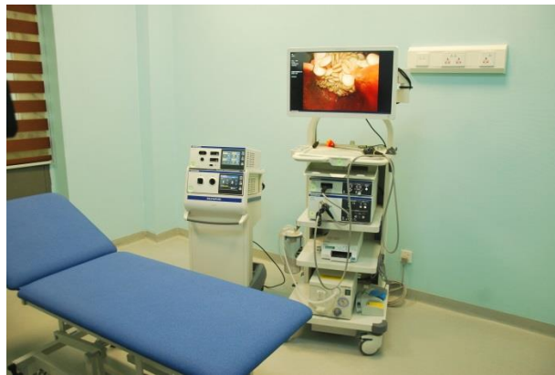
Endoscopy suite, Southshore Women's Clinic, Lagos