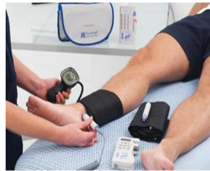
Sonicaid SD2 Vascular Assessment Kit