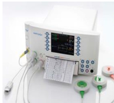
Sonicaid FM 830 Fetal and Maternal Risk CTG