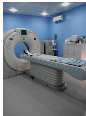
Toshiba Aquilion Prime 160-slice CT, Aminu Kano Teaching Hospital, AKTH Kano