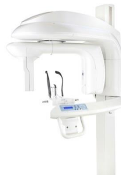
CS 9300 Cone Beam Computed Tomography (CBCT)