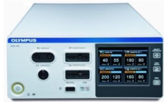
ESG 400 Electrosurgical Unit