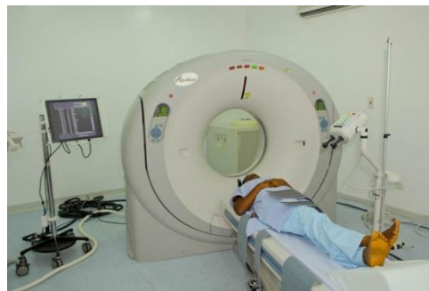
Toshiba Aquilion RXL 64 Slice CT, Lifebridge Diagnostic Centre, Abuja