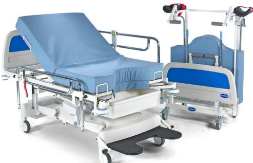
Birthright™ Delivery Bed