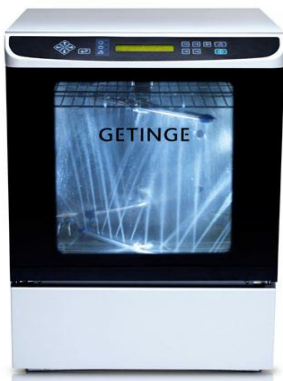
WD 15 Claro Washer Disinfector

Together, JNC International and Getinge are working to build the awareness of the importance of Infections Control for new and existing hospitals in Nigeria.