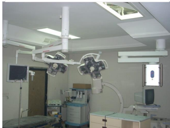
Operating Theatre Suite, Delta State University Teaching Hospital, Oghara, Delta State