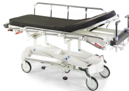
Lifeguard 20 Patient Trolley