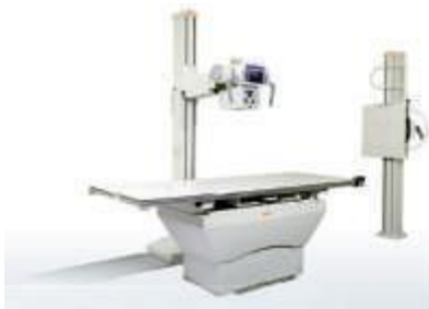
Ascend Floor mounted X-ray

Carestream's Ascend™ floor-mounted X-Ray system is ideal for busy Radiology Departments or specialized Orthopaedic practices. It comes with a range of Bucky table options of a freestanding tube stand that eliminates the cost and time involved in installing ceiling mounted rails, and can also be used in facilities that cannot support a ceiling-mounted system. The 500KW, 3 PHASE ODYSSEY™ generator option is designed to minimize radiation dose and exposure time while maximizing image quality. Automated control settings allow users to select various imaging parameters quickly, and software options ensure the per-patient examination time is reduced to maximize patient throughput.