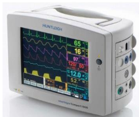
SmartSigns Compact 1000 Patient Monitor