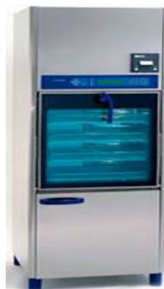
HS 46-4 Washer Disinfector