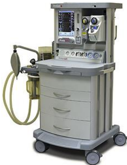
Prima 465 Anaesthesia Systems