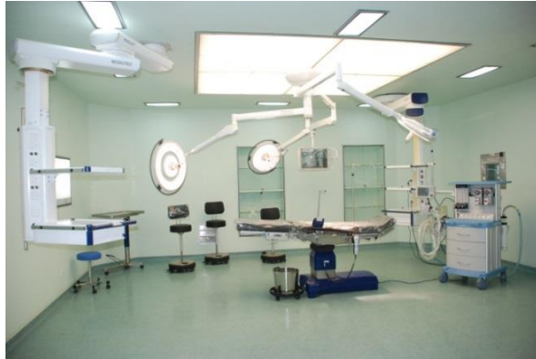
Operating Theatre Suite, University College Hospital, Ibadan