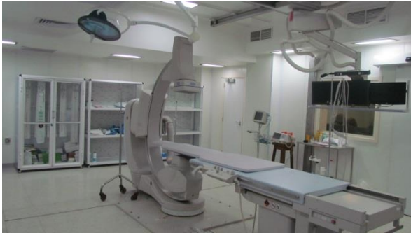
Toshiba Infinix- I Cathlab Suite, University College Hospital, UCH Ibadan