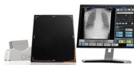
DRX-1 Flat Panel Detector DR System