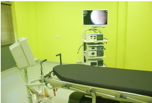
Endoscopy suite, Ibom Specialist Hospital, Uyo, Akwa Ibom State