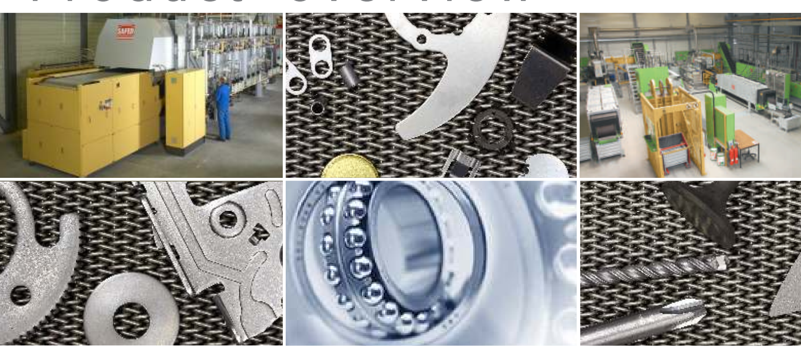
Plants and solutions for heat-treatment of serial parts