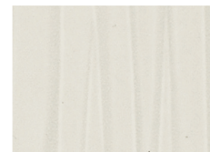
Ruched Chiffon P391