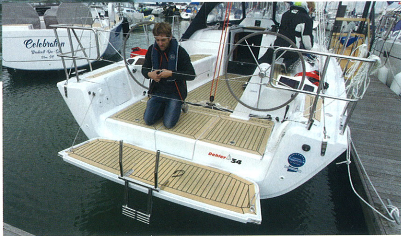
LEFT The bathing platform can be removed if you take the racing version of the 34