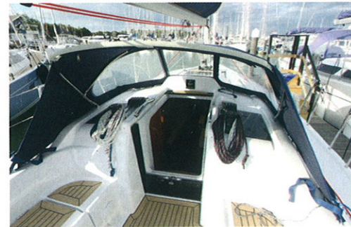
RIGHT The cockpit is sensibly laid out with Dehler's clever drop-down washboards

a good thing as the 46 featured a sensibly laid-out cockpit; very clear and uncluttered, with very well-placed integral instrument pods in front of each wheel and exactly where they need to be. Twin wheels are standard, but there is a competition pack that has the option of tiller steering along with longer carbon-fibre spars and other weight-saving measures such as synthetic teak and doing away with the bathing platform – it is worth keeping this, though, as it's a nice size and comes with a very nifty swim ladder.