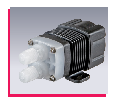
IWAKI is a world wide leading pump manufacturer. Our high quality, compact products, such as air, magnetic drive and metering pumps, are widely used in medical, laboratory and environmental control systems.