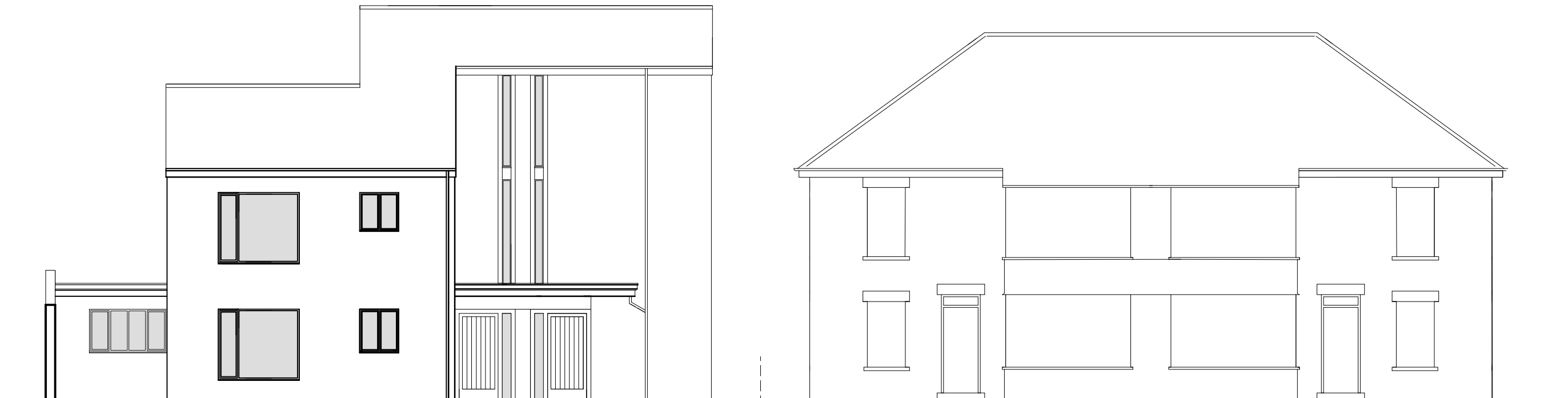
FRONT ELEVATION IN CONTEXT OF NEIGHBOURING PROPERTY