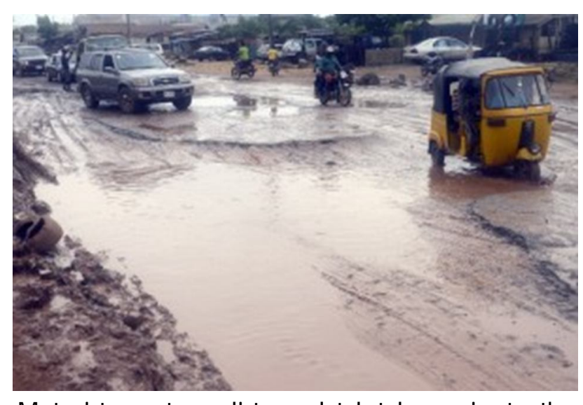
Motorists, motorcyclists and tuk-tuks navigate the Ikorodu-Shagamu road at Ogijo in Ogun State on October 23, 2014.