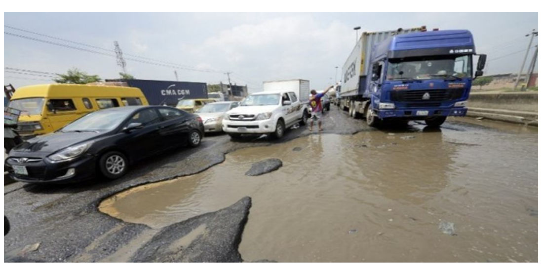
Oshodi-Apapa Expressway October 2014.