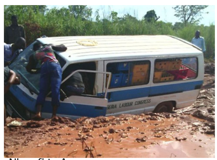
Nkerefi to Amagunze (Nkanu East, Enugu State)