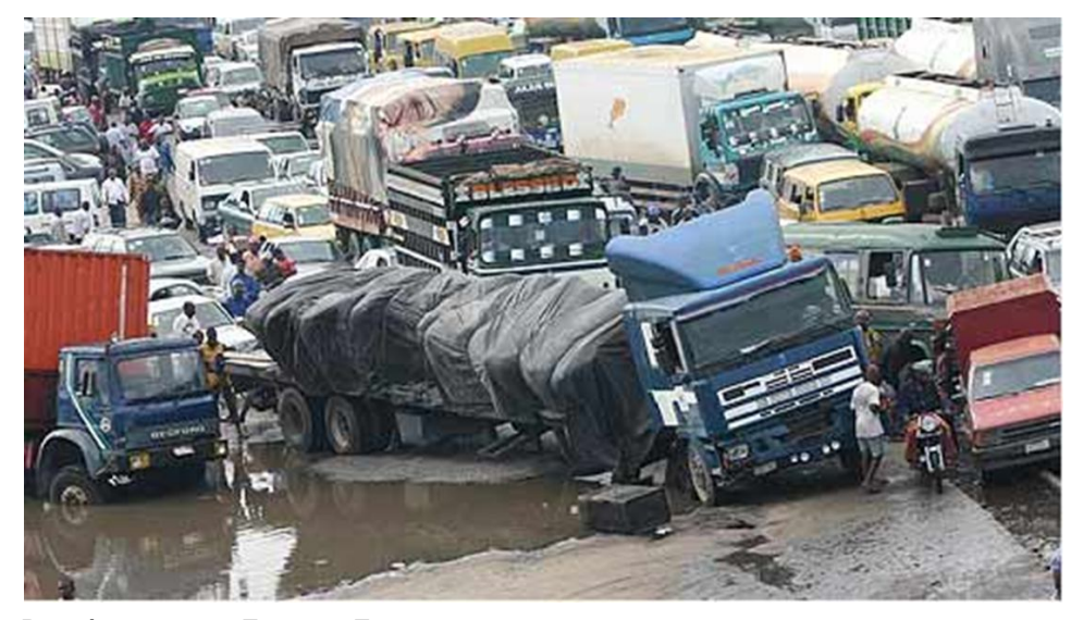
Portharcourt Enugu Expressway